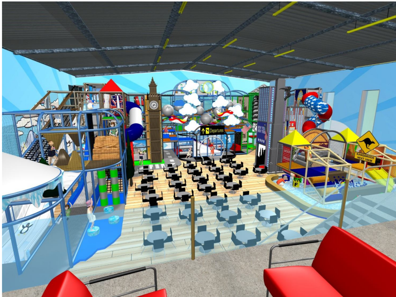
Computer generated images of how the new Play Area & Gym will look...