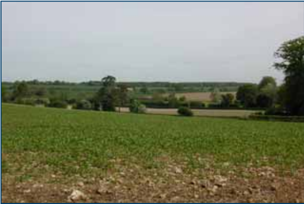
Bramdean, from Bramdean Church