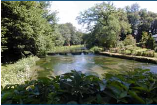
River Itchen at Brambridge Park