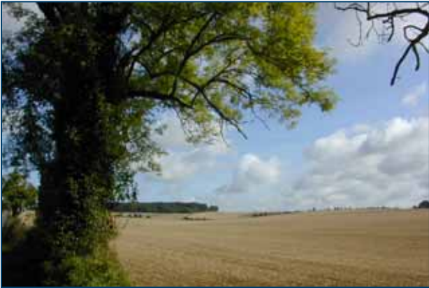
Near Upper Abbotstone Wood