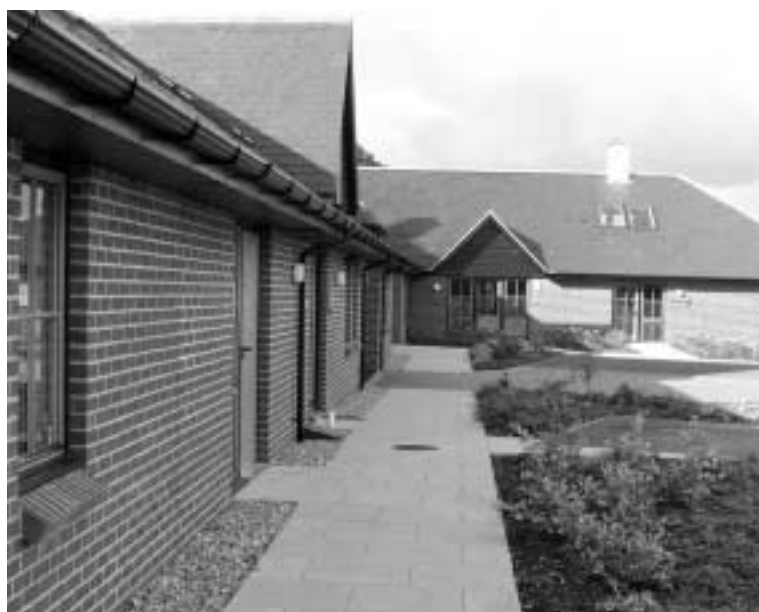
"Small-scale employment development falling within Use Class B1 can normally be accommodated in the settlements".

7.15 Particular attention should be paid to the effect of the proposed development and associated activity on the immediate vicinity of the site and the surrounding area. While there is scope for mixing employment and other forms of development, it is important