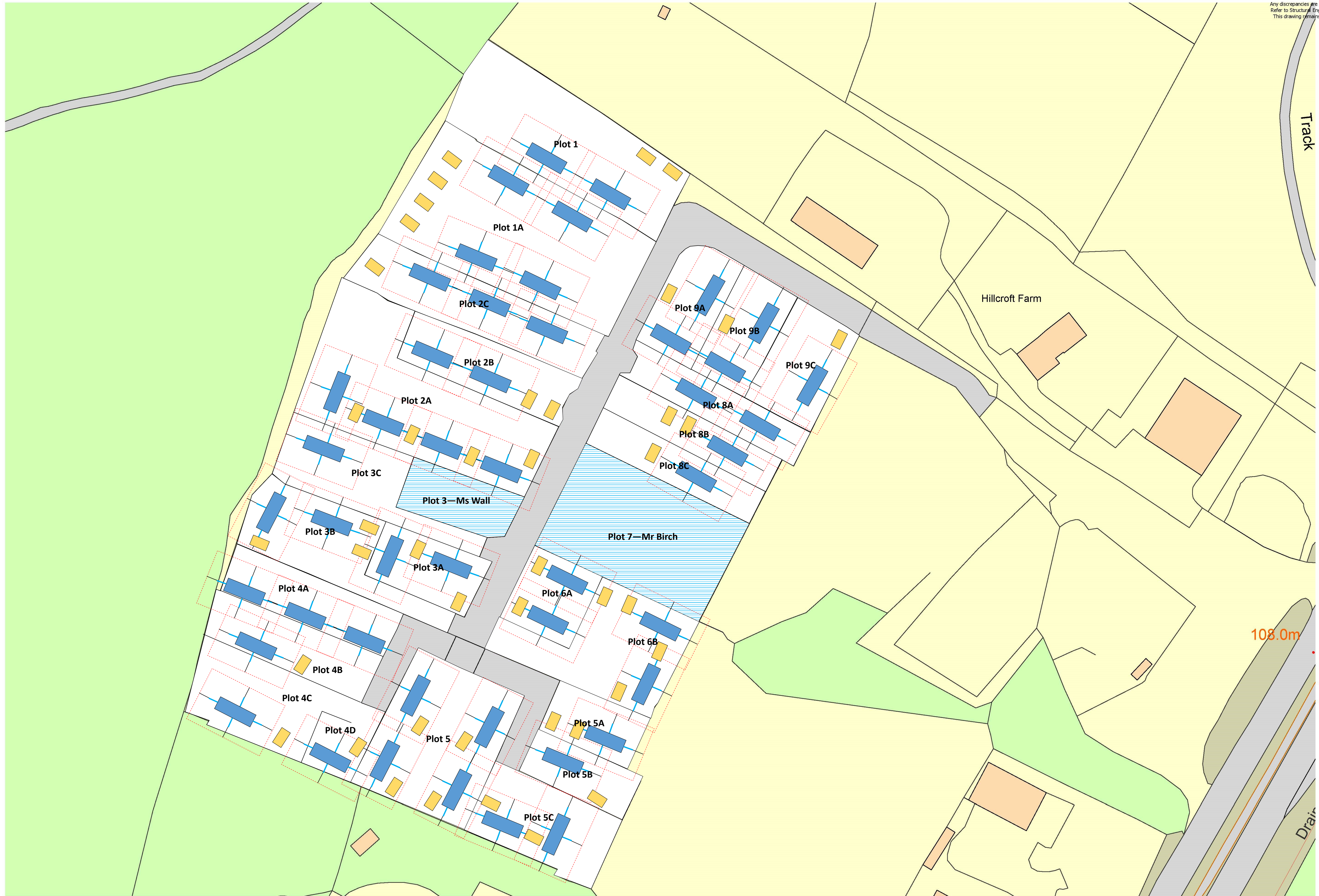
Drawing J004151-DD01 - Illustrative Site Layout Plan - Rev A