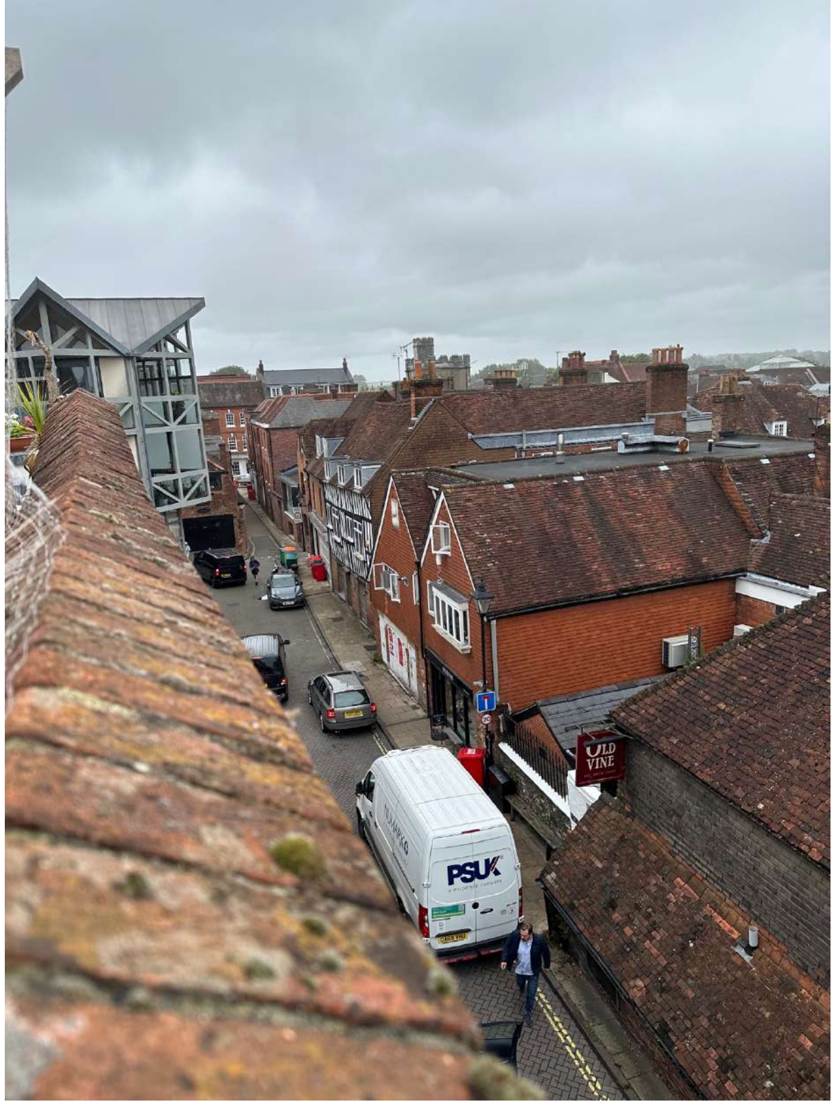
Fig D14: View from 2 Calpe Yard Terrace, north west