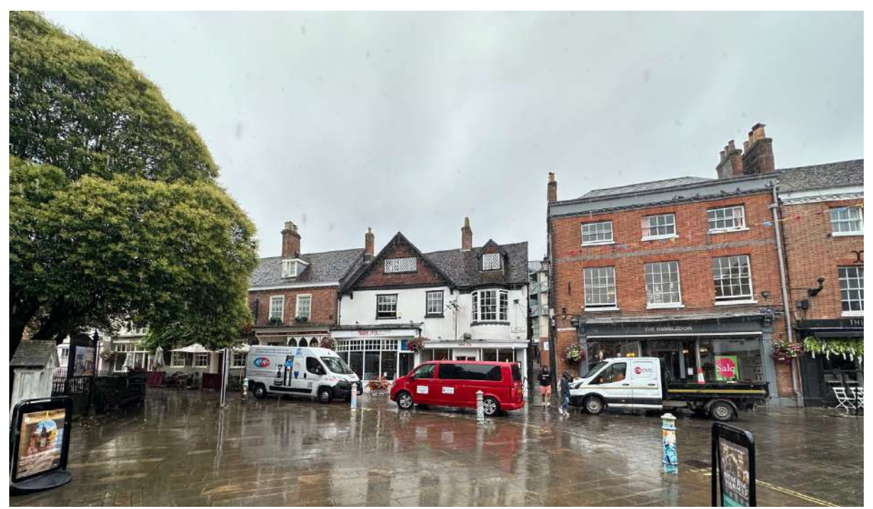
Fig D7: View towards Calpe Yard (behind white rendered building) from The Square / Great Minster Street