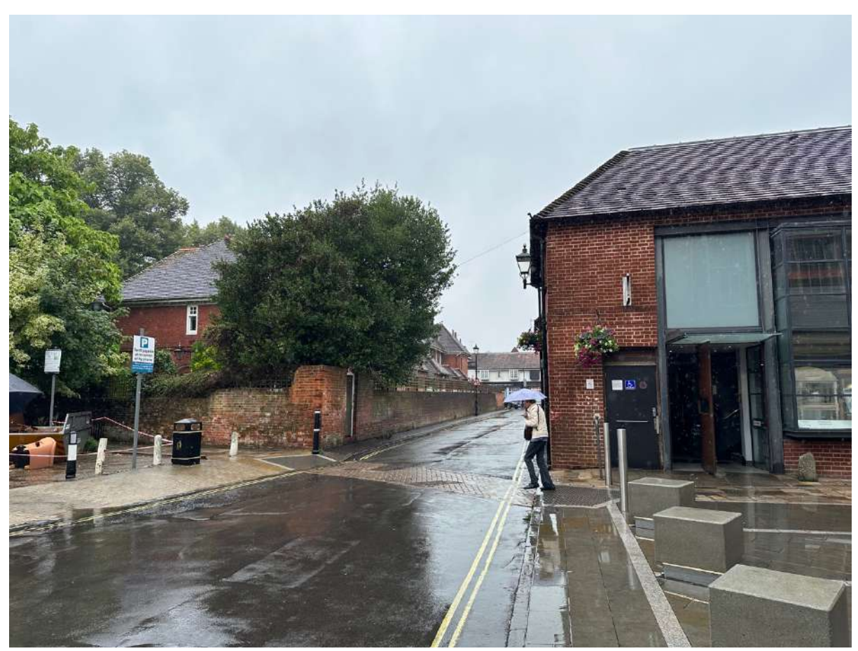
Fig D8: View towards Calpe Yard from St Michaels Covert