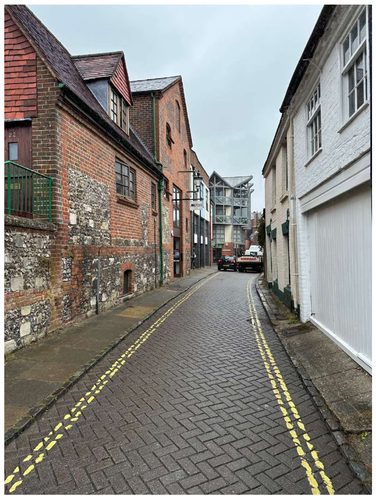
Fig D5: North view along Little Minster Street (1-5 Calpe Yard to left with rendered upper storey)