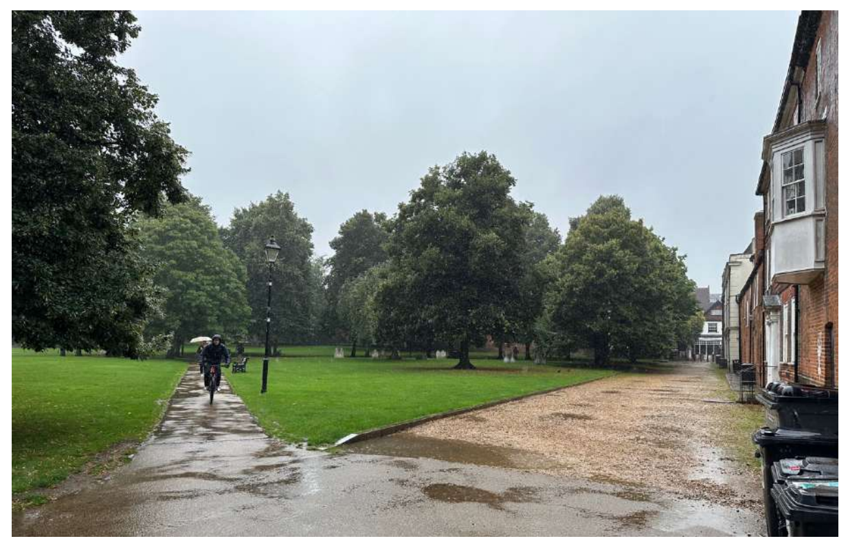
Fig D9: View towards Calpe Yard from Outer Close