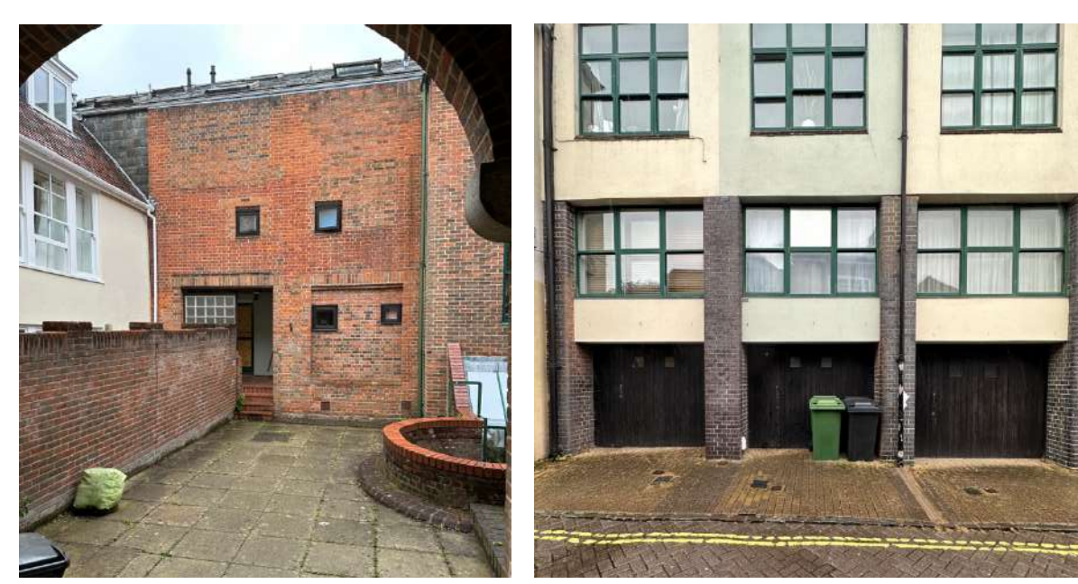
Fig D2: 2 Calpe Yard, Western showing ground floor garaging