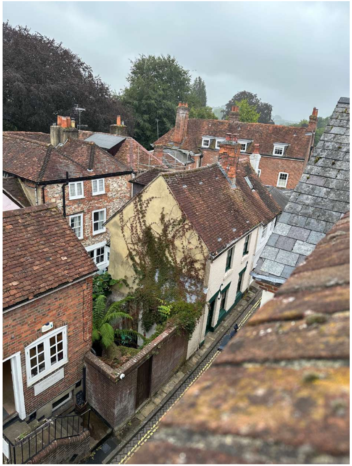
Fig D14: View from 2 Calpe Yard Terrace, north east