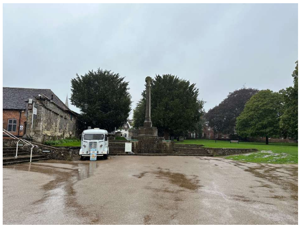
Fig D11: View from western front of Catherdral towards Calpe Yard (obscured by landscaping and buildings)