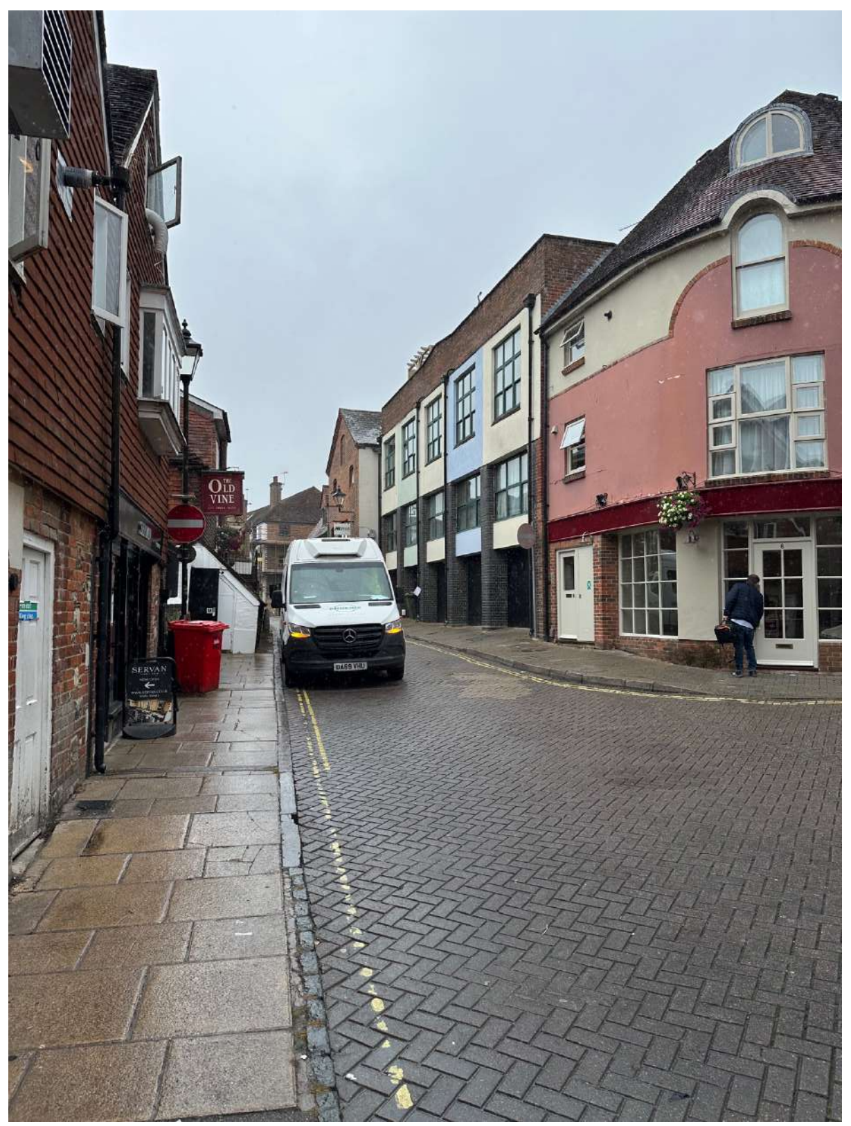
Fig D6: South View along Little Minster Street (1-5 Calpe Yard to right)