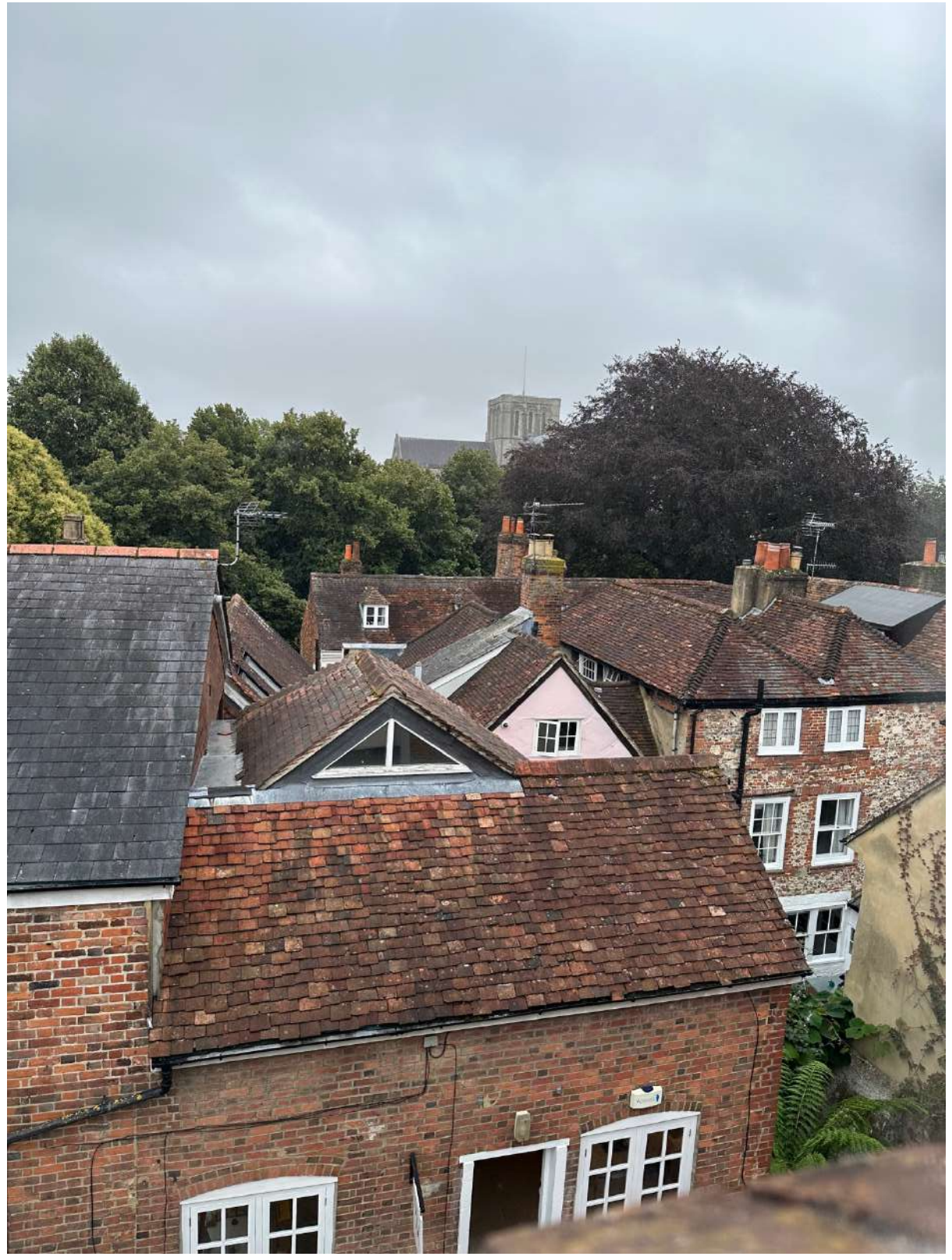
Fig D13: View from 2 Calpe Yard Terrace, towards Cathedral