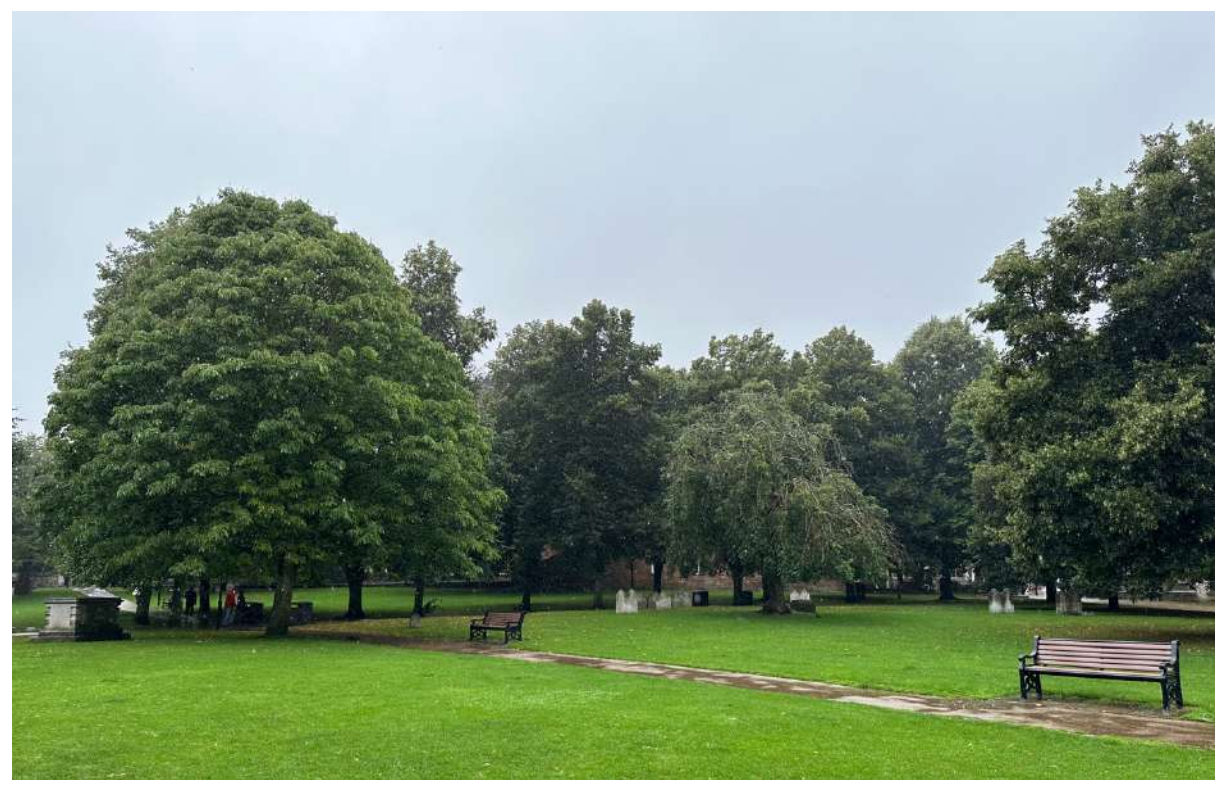
Fig D10: View towards Calpe Yard from Outer Close