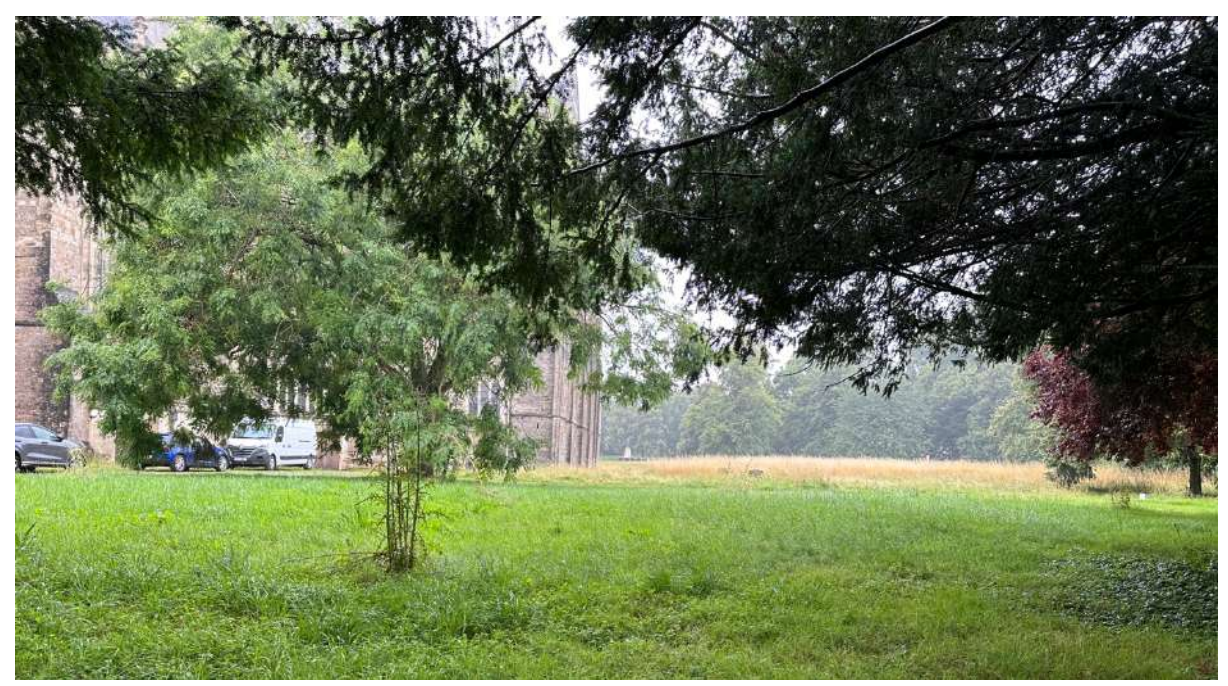
Fig D12: View from Paternoster Row, Outer Close towards Calpe Yard