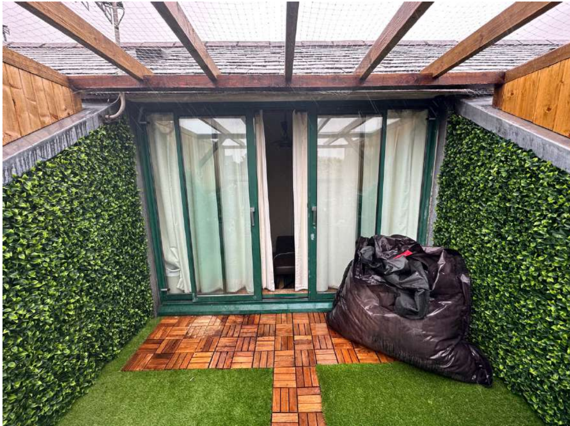
Fig C4: Pergola Enclosure view looking west (showing relationship with eastern elevation of house)