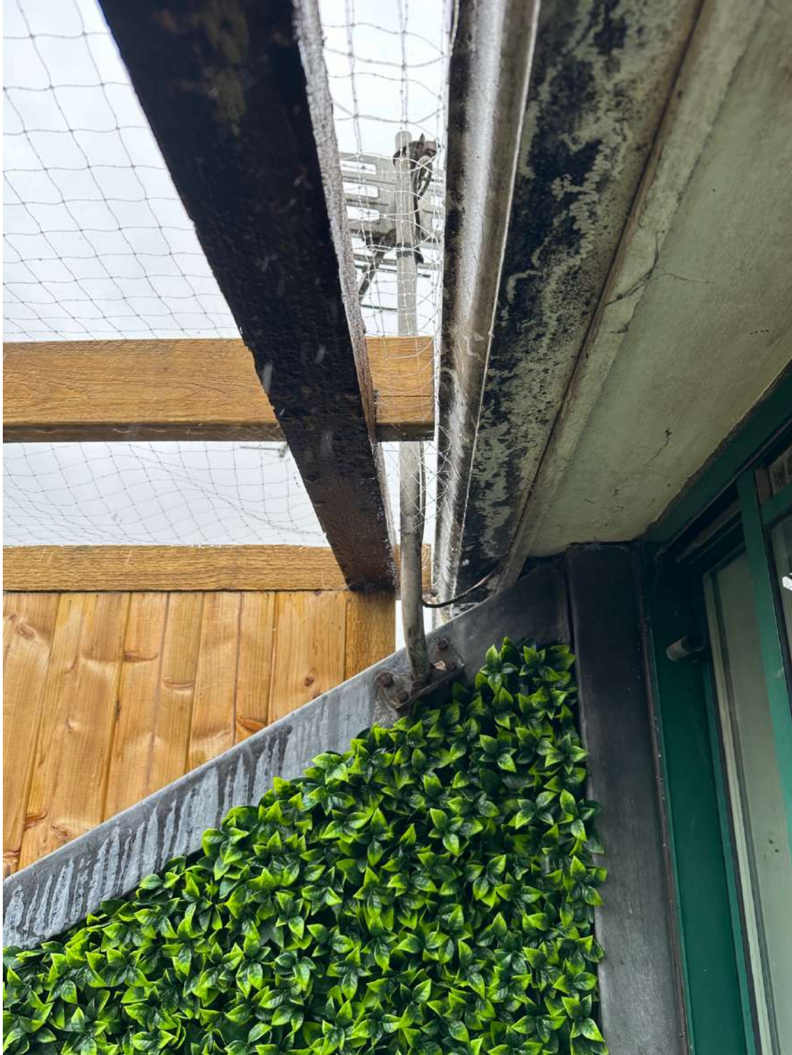
Fig C5: Pergola Enclosure – close up view showing relationship with roof eaves