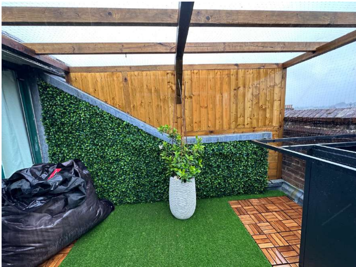
Fig C2: Pergola Enclosure view looking north (existing wall obscured)