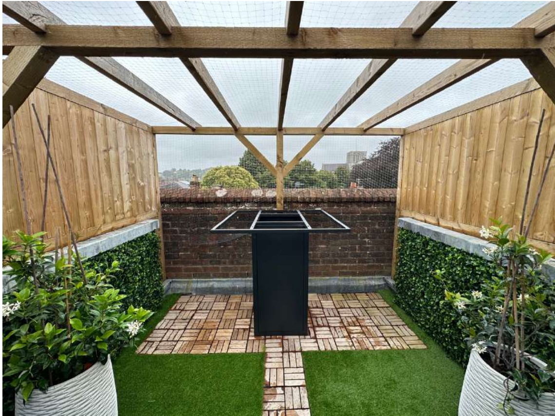
Fig C1: Pergola Enclosure view looking east