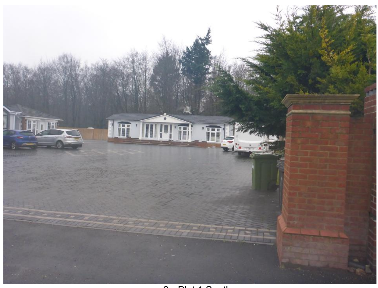
2. Plot 1 South