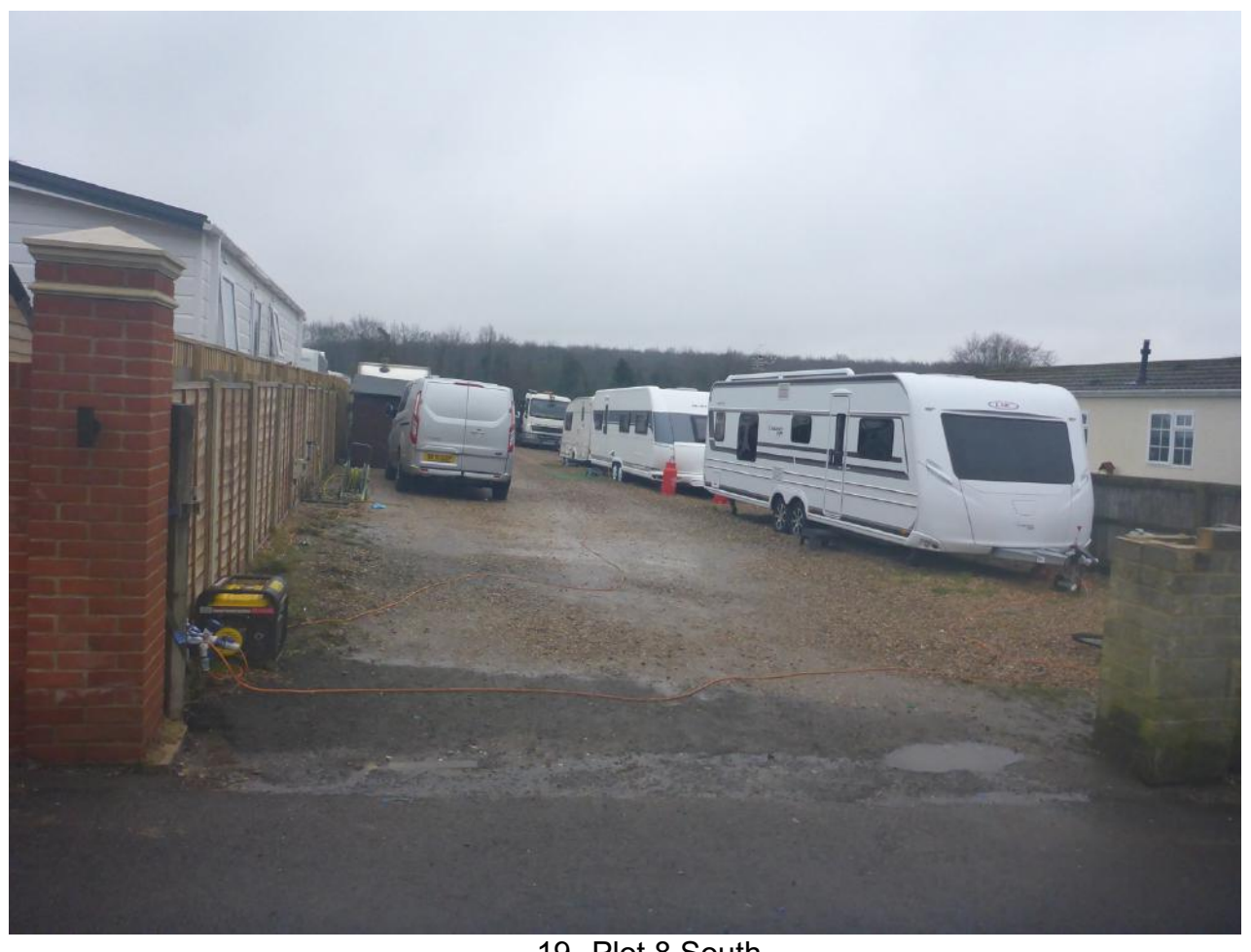
19. Plot 8 South