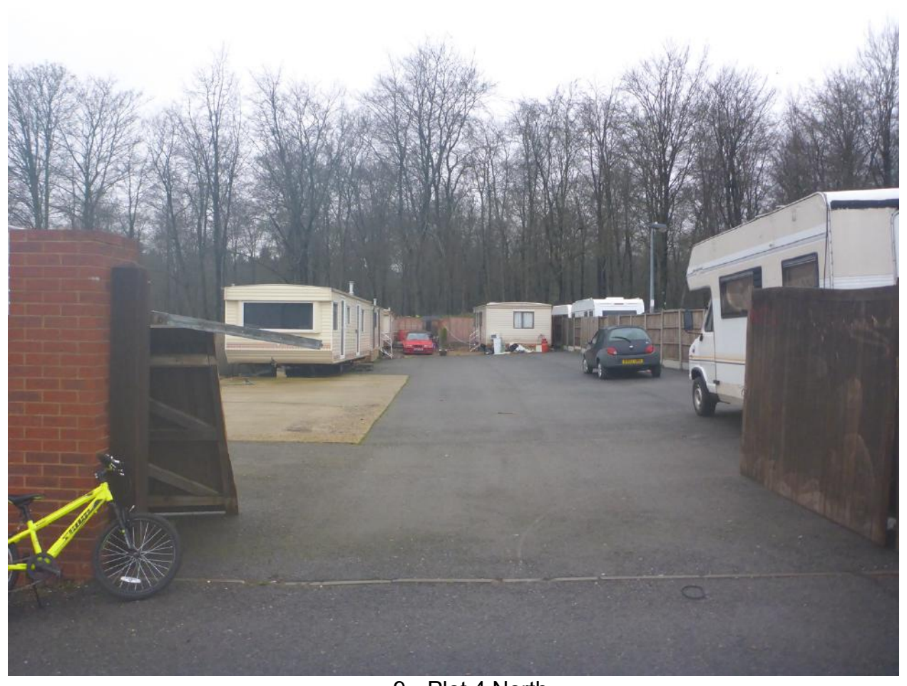
9. Plot 4 North