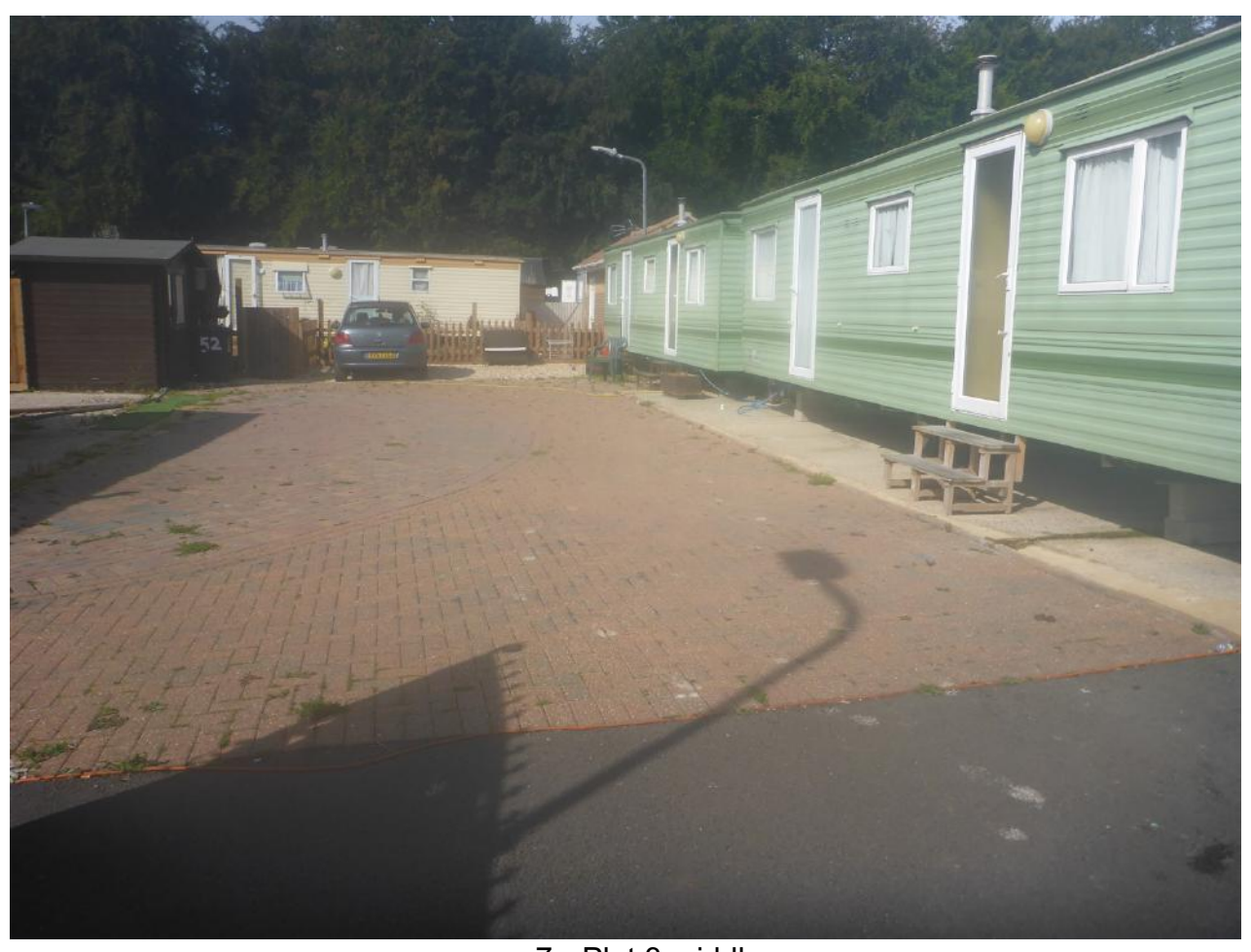
7. Plot 3 middle