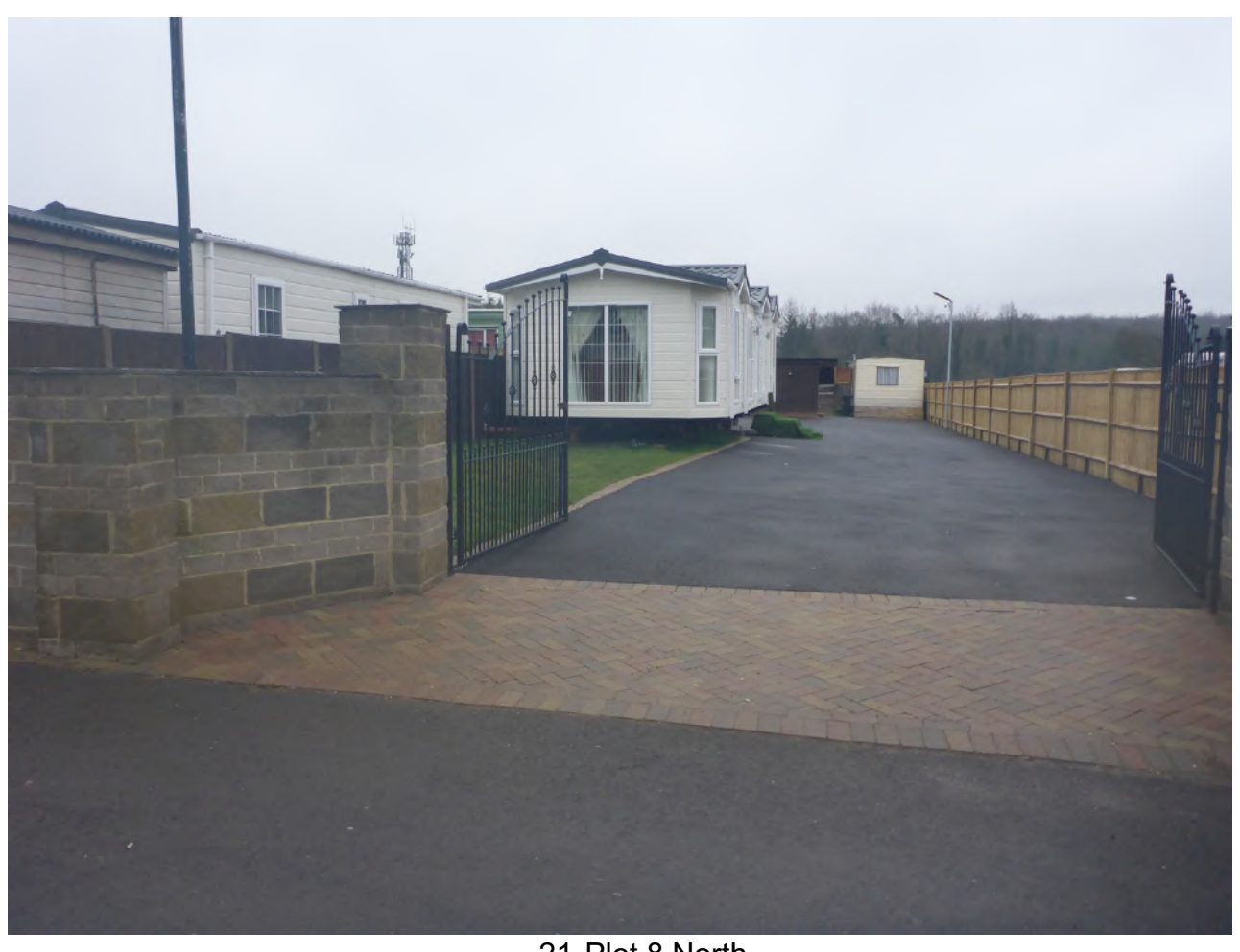
21. Plot 8 North