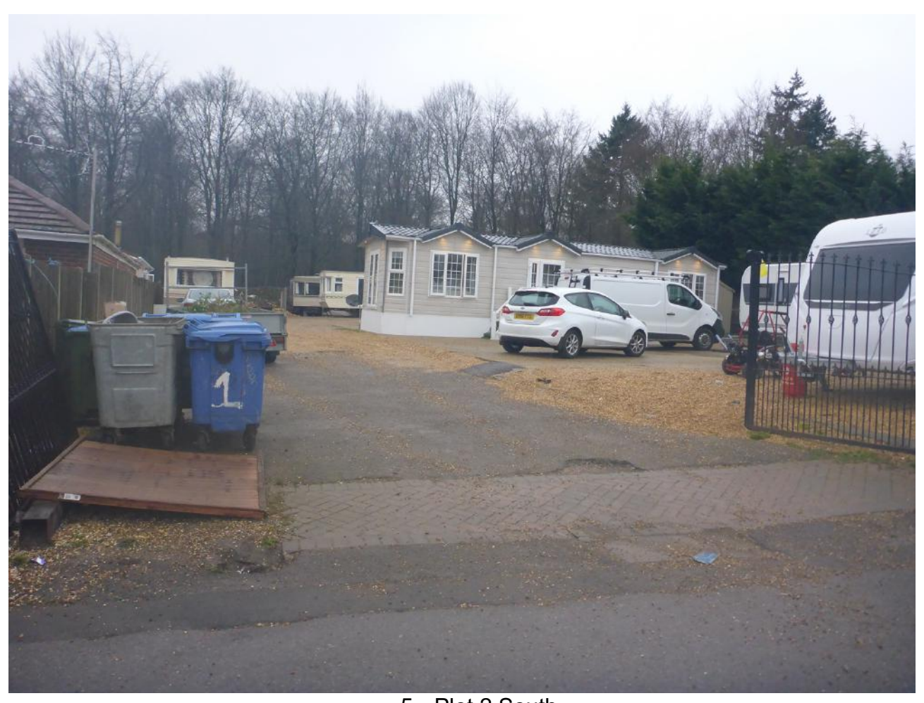
5. Plot 2 South