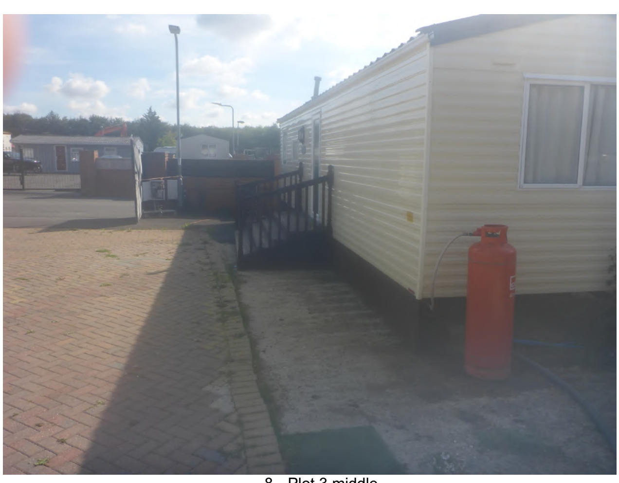
8. Plot 3 middle