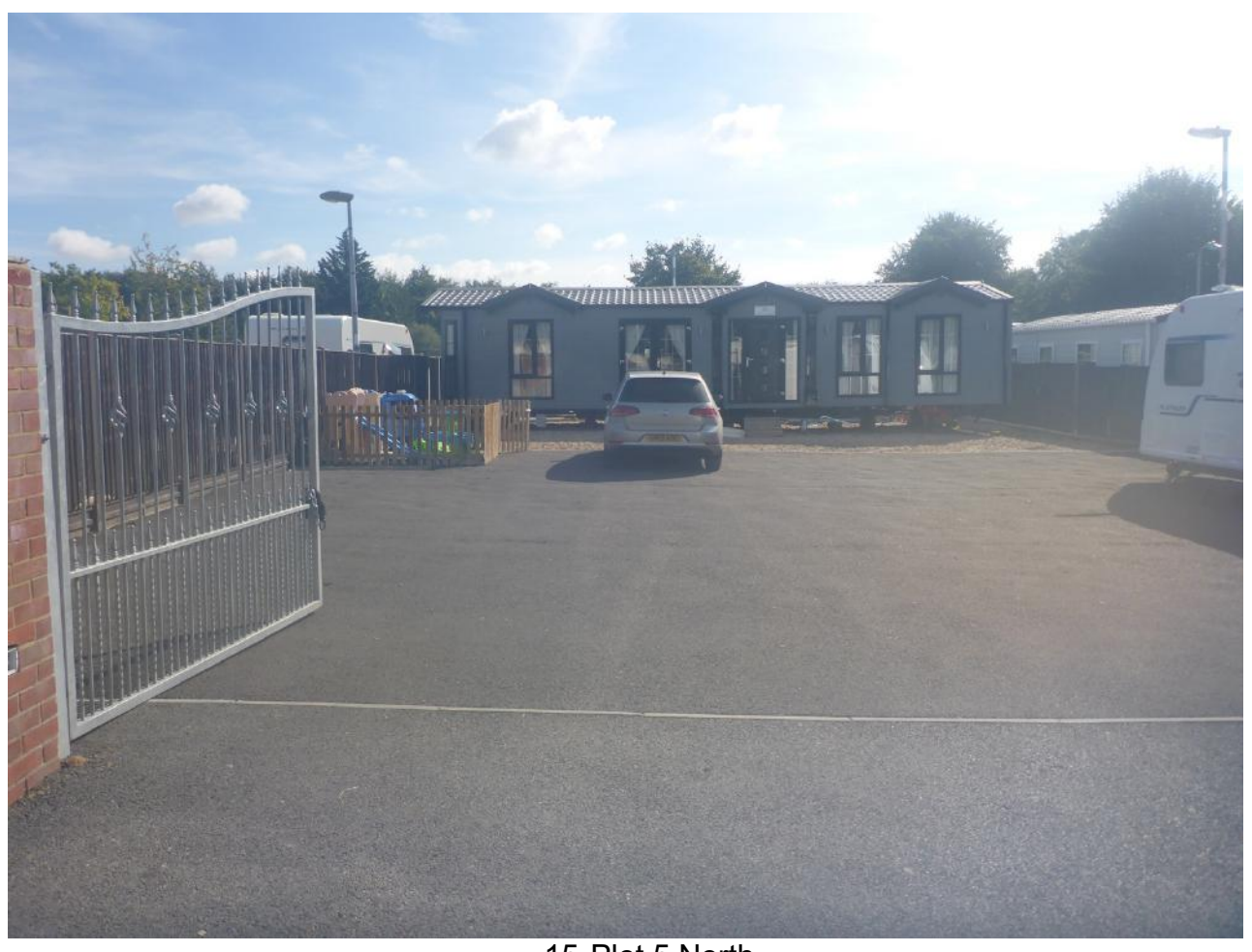
15. Plot 5 North