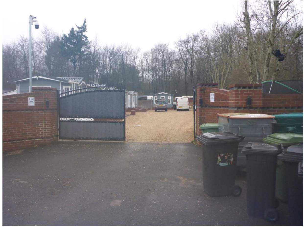
1. Plot 1 North