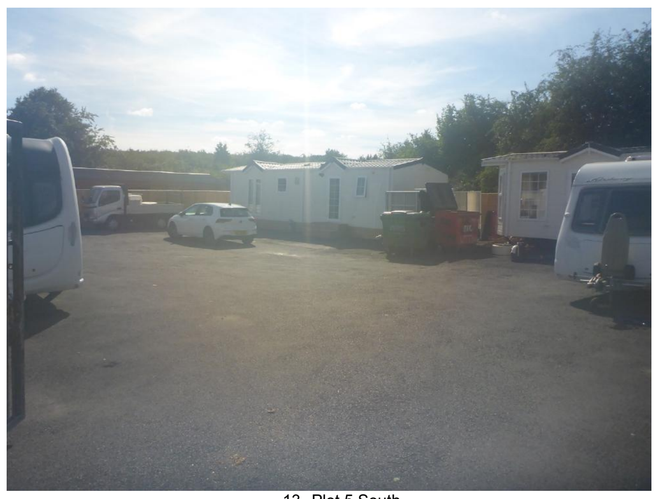
13. Plot 5 South