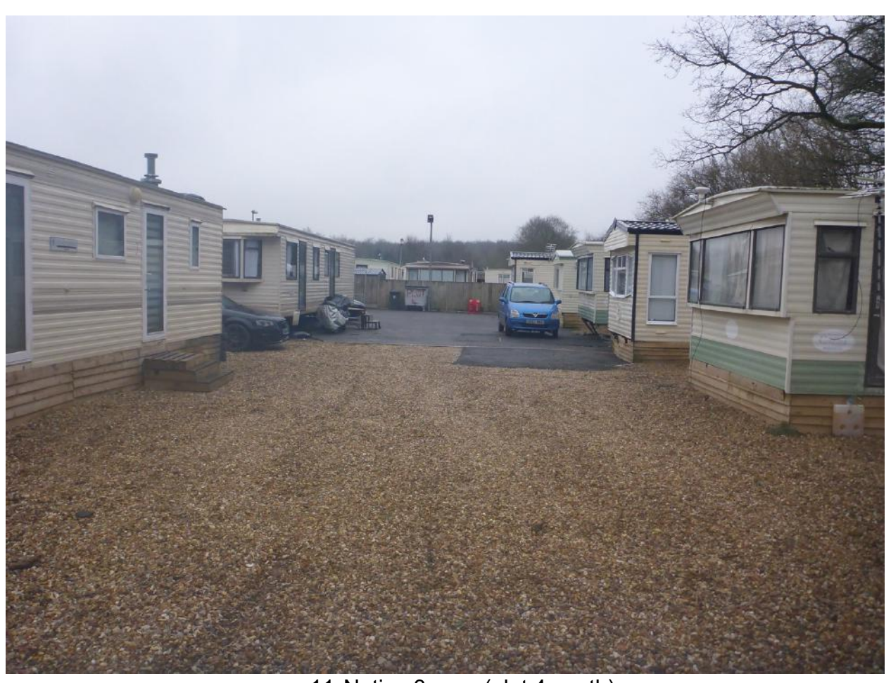
11. Notice 3 area (plot 4 south)