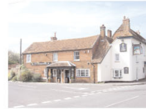
The pub on the square provides a fitting landmark to the centre of the village