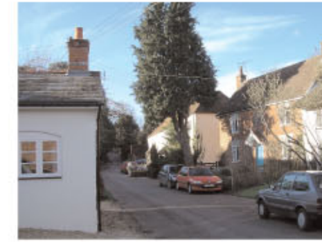
Good enclosure at the southern end of the village, with 2 storey buildings at back of pavement