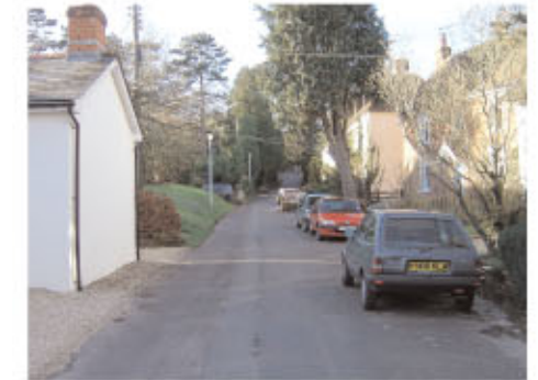
the eastern side comprises set back buildings and low fences & drives, giving poor enclosure