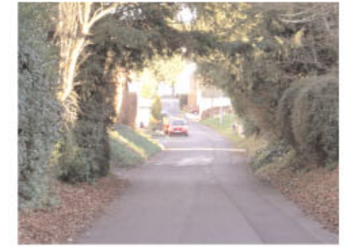
The eastern side of Oxford road is generally better defined than the west.