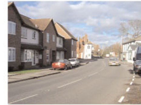
Good enclosure at the southern end of the village, with 2 storey buildings at back of pavement