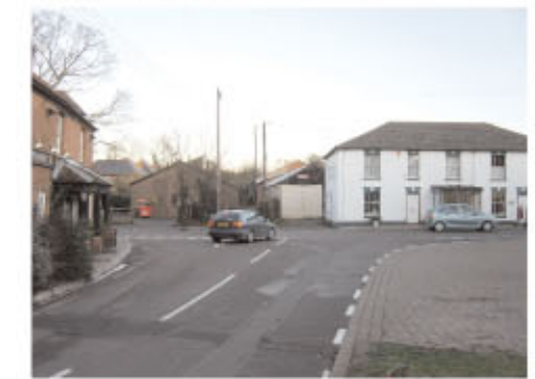
Taylor's Coaches buildings to the east provide enclosure and the potential for other uses