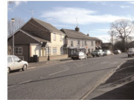
The western frontage to the road includes the post office which is positioned on the back of pavement