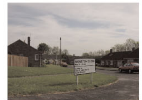
The character of the lane changes after the railway bridge with large verges of Gratton & Wonston Close