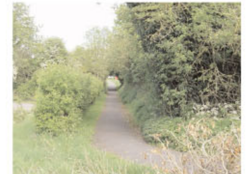
The footpath adjacent the site sets back behind the hedge to Wonston Lane