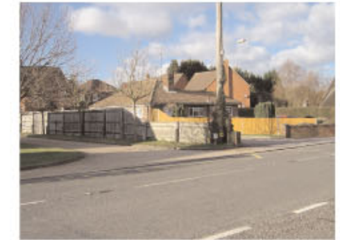
the eastern side comprises set back buildings and low fences & drives, giving poor enclosure