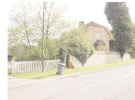
Walls & planting define the road, there is no footpath for most of its length