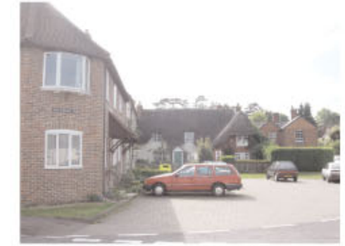
Car parking on the square erodes its significance in the heart of the village