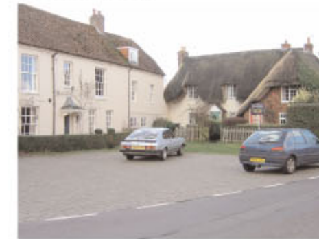
Good enclosure to the south with 2 storey residential buildings of character