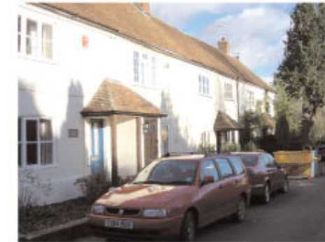
The western frontage to the road includes the post office which is positioned on the back of pavement