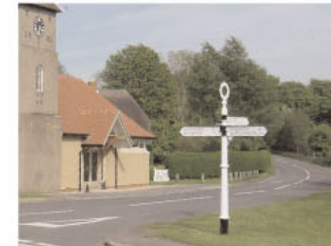
Wonston lane is rural in character with isolated cottages set back behind hedges & trees