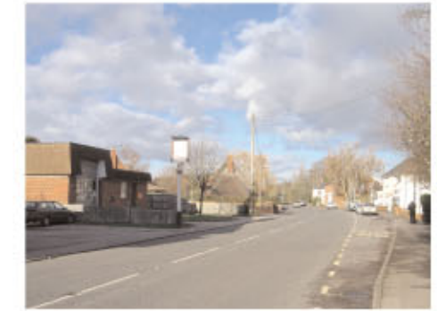
The eastern side of Oxford road is generally better defined than the west.