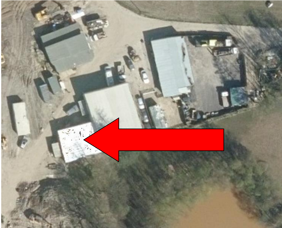
(WCC Latest Aerial Imagery)