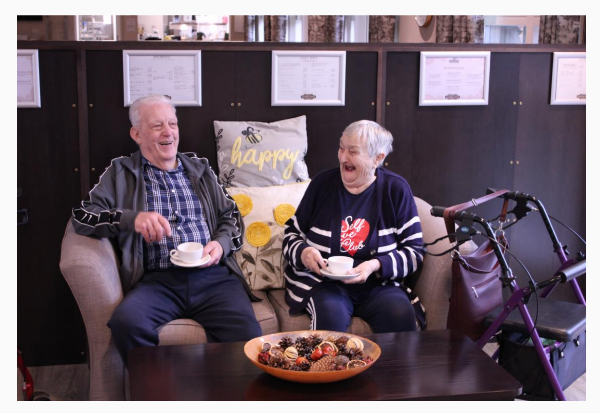
Extra Care can be extra fun!

locations, charges, terms and conditions, how to submit an application please visit our website winchester.gov.uk/housing/garages or contact us by email garages@winchester.gov.uk or phone 01962 814 922