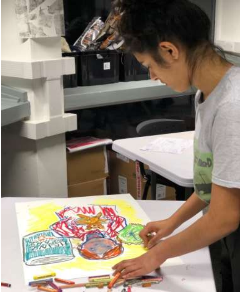
After school Art Club @ WSA

The University is committed to making a greater contribution to the civic life of the city: Developing our art school and establishing a new facility on the River Park site would deliver many benefits, including: