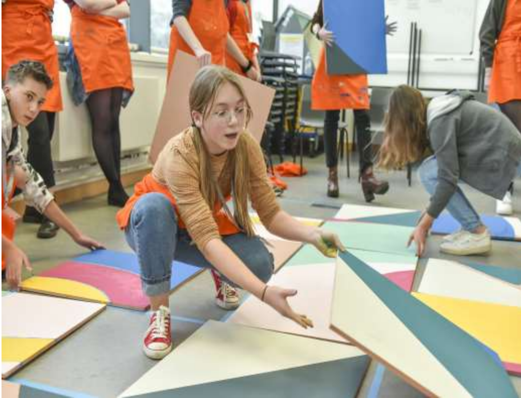
National Art & Design Saturday Club @ WSA

Winchester City and The University of Southampton: