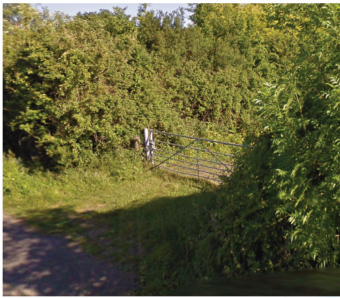
Old gate entrance