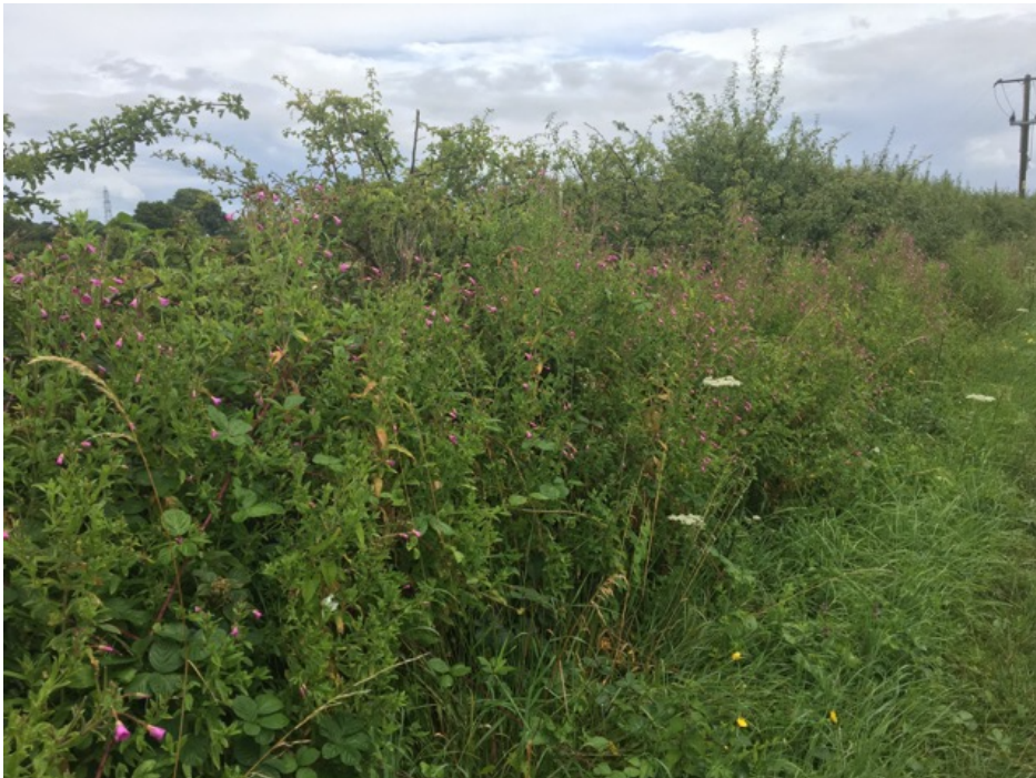
Photo taken after a large proportion of the hedgerow cleared