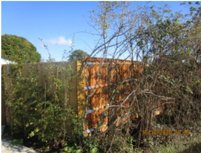
New Fence panels being installed down the length of the important hedgerow