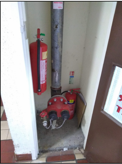
3. Dry riser cupboard & extinguisher.