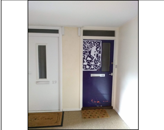
13. Flat 18 original door.