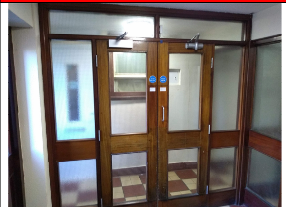
5. Fire-doors to gr. Fl. Corridor flats.