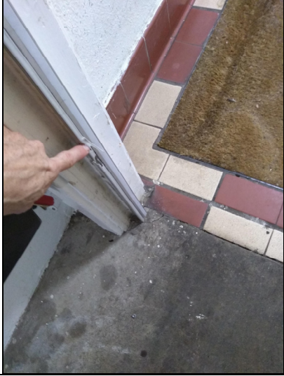
1. Damaged smoke seal to FD30.