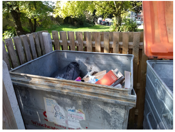
7. Recycle bin with no lid.