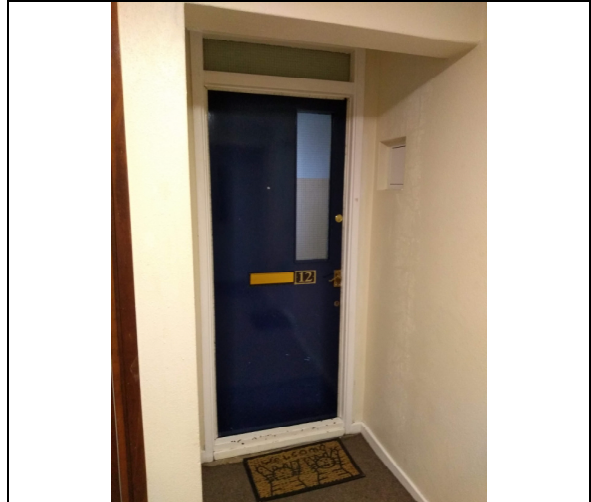
16. Flat 12 door.