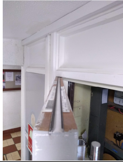
2. Smoke seals to service cupboard FD30.