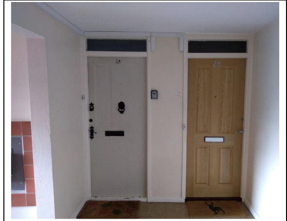
14. Flats 28 & 29 doors.