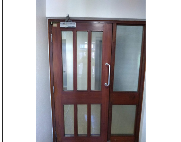
10. Lobby fire-door to landing.