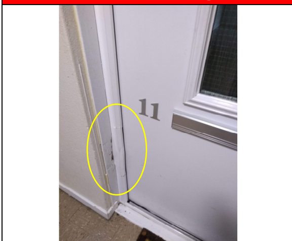
17. Flat 11 door frame damaged.