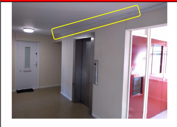
11. Telecoms cables, conduit to landing.