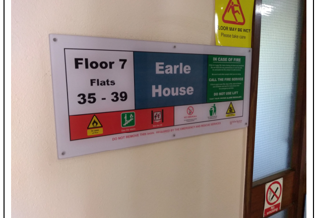
8. Landing pictogram signage .