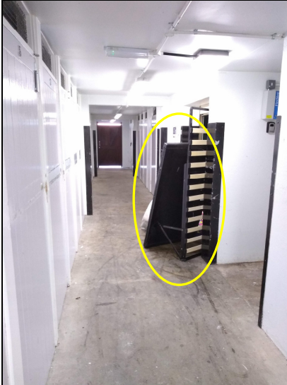
4. Dumped resident items.