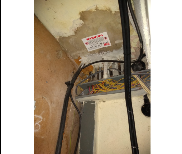
9. Fire stopping to service cupboard.