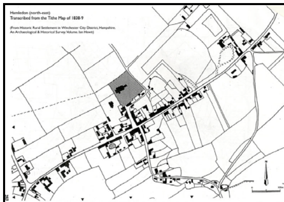
Hambledon (NE) Tithe map 1838-39

that it was at Hambledon that the game was put on a firm organized basis. It is therefore fitting that the village be referred to as 'The Cradle of Cricket'. In June 1777 Hambledon played the All England team for 1,000 guineas (a huge sum of money in those days) and won by an innings and 168 runs. The last recorded game played by the original team was at Lords Cricket Ground in 1793.