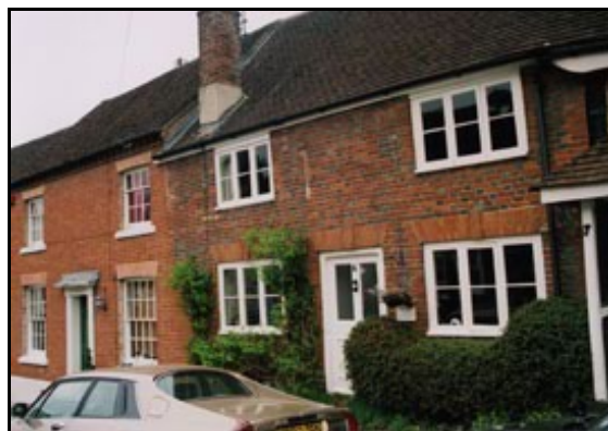
Photo 35: The use of traditional materials and details is important in the conservation area (no. 6 High Street)