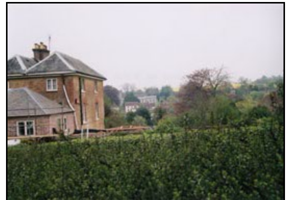
Photo 39: Views into, out of, and across the conservation area must be protected