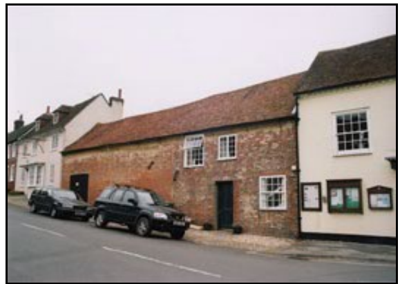
Photo 33: The former barn in High Street has inappropriate windows