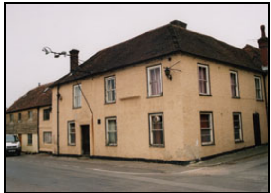
Photo 22. Former New Inn, West Street

6.3.4 In West Street, the former New Inn dates to the 18 th century, as indicated by the modillion eaves cornice, but has been refenestrated with late 19 th century sashes. Despite its very poor condition, the building makes an important contribution to the street and should be urgently repaired and put back into a viable use.