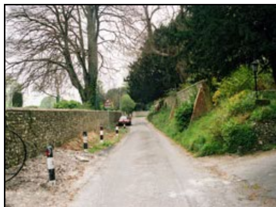
Photo 41: Flint walls are important in the conservation area (Church Lane)

9.9.3 The flint walls in Hambledon make a valuable contribution to the special character of the conservation area. Most of these form the boundary to a listed building, so they have additional protection to that already afforded to structures within a conservation area. However to prevent the partial demolition of unlisted walls in the conservation area, the City Council could consider serving an Article 4 (2) Direction which would prevent the unauthorised demolition of small sections of wall, perhaps to create a vehicular access.