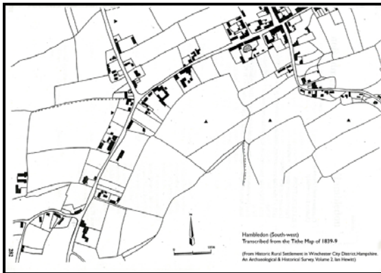
Hambledon (SW) Tithe map 1838-39