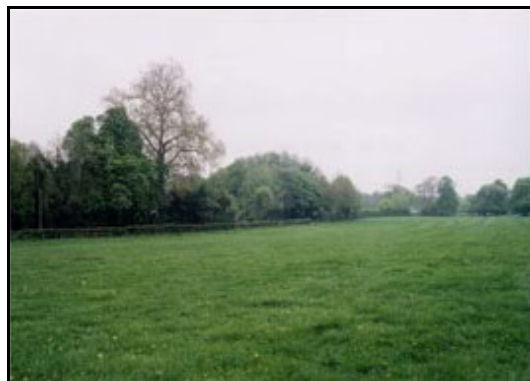
Photo 38: The landscape around Hambledon must continue to be protected (west of Hambledon Road)