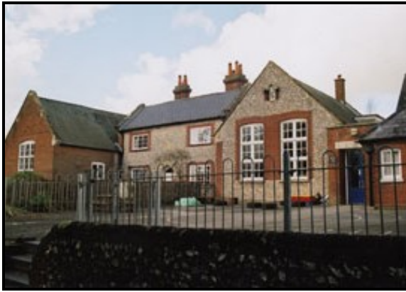
Photo 8: Hambledon Primary School

4.1.13 The War Memorial tells its own story of the toll of Hambledon in the two world wars. On 22 nd May 1944, King George VI visited Hambledon to review troops assembled in and around the parish in readiness for D Day. Hambledon lost 33 men in World War I, and a further eight men were killed in World War II.