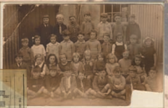
School Photo 1927 Recreation ground