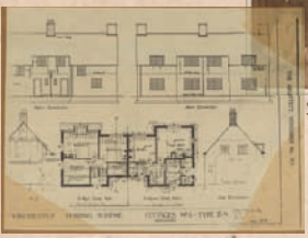
Architect plans for first houses