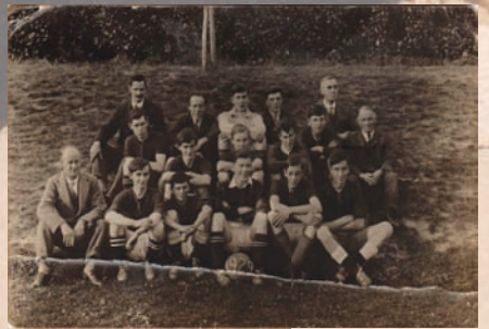
Football team 1929