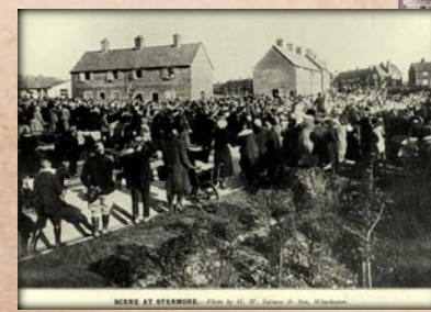
SCENE AT STANMORE.