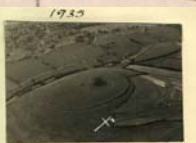
1935 St Catherine's Hill June 1935 a favorite playground for Stanmore children.