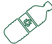
Plastic bottles (Top off please)