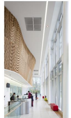
Reception area (LA architects)