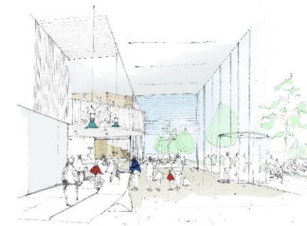
View from inside the entrance foyer