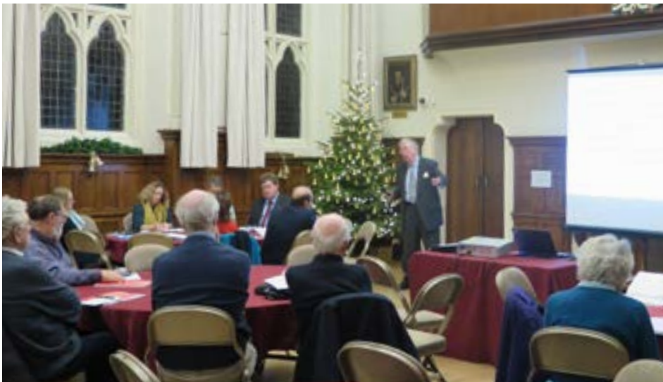
Archaeology event, Guildhall, December 2018

Events have taken place to enable people to find out more about the archaeological aspects of the Central Winchester Regeneration project.