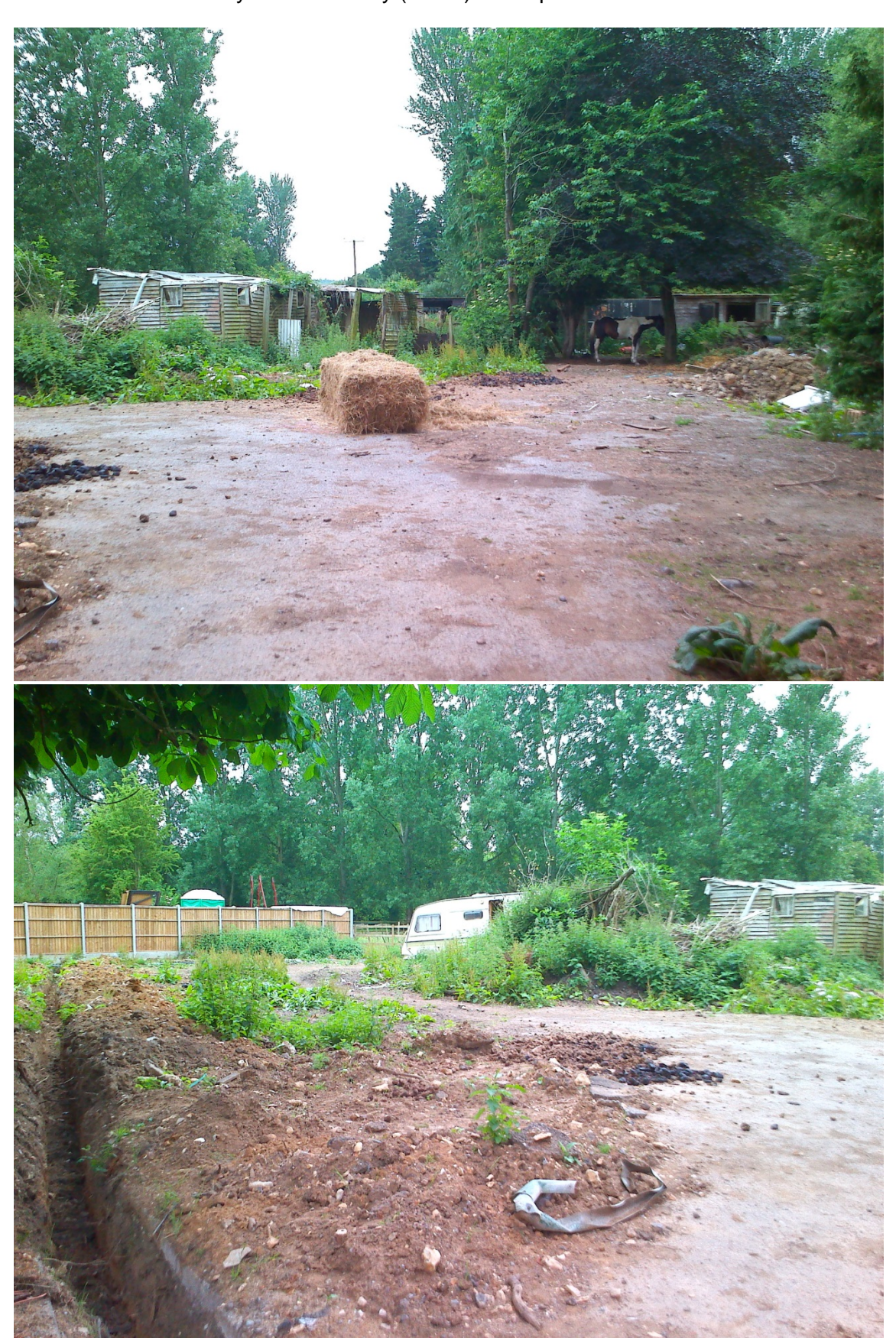
Drainage run – serving plot 3 Unoccupied caravan and looking towards plot 3