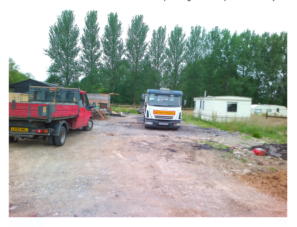
Plot 7 Photo taken from entrance. Reads as one pitch together with plot 8 – ancillary uses