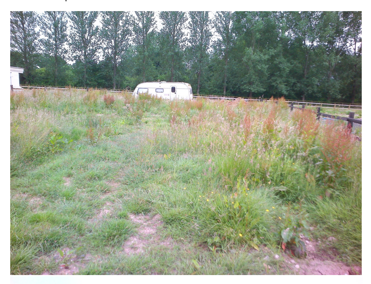
Plot 6 unoccupied caravan