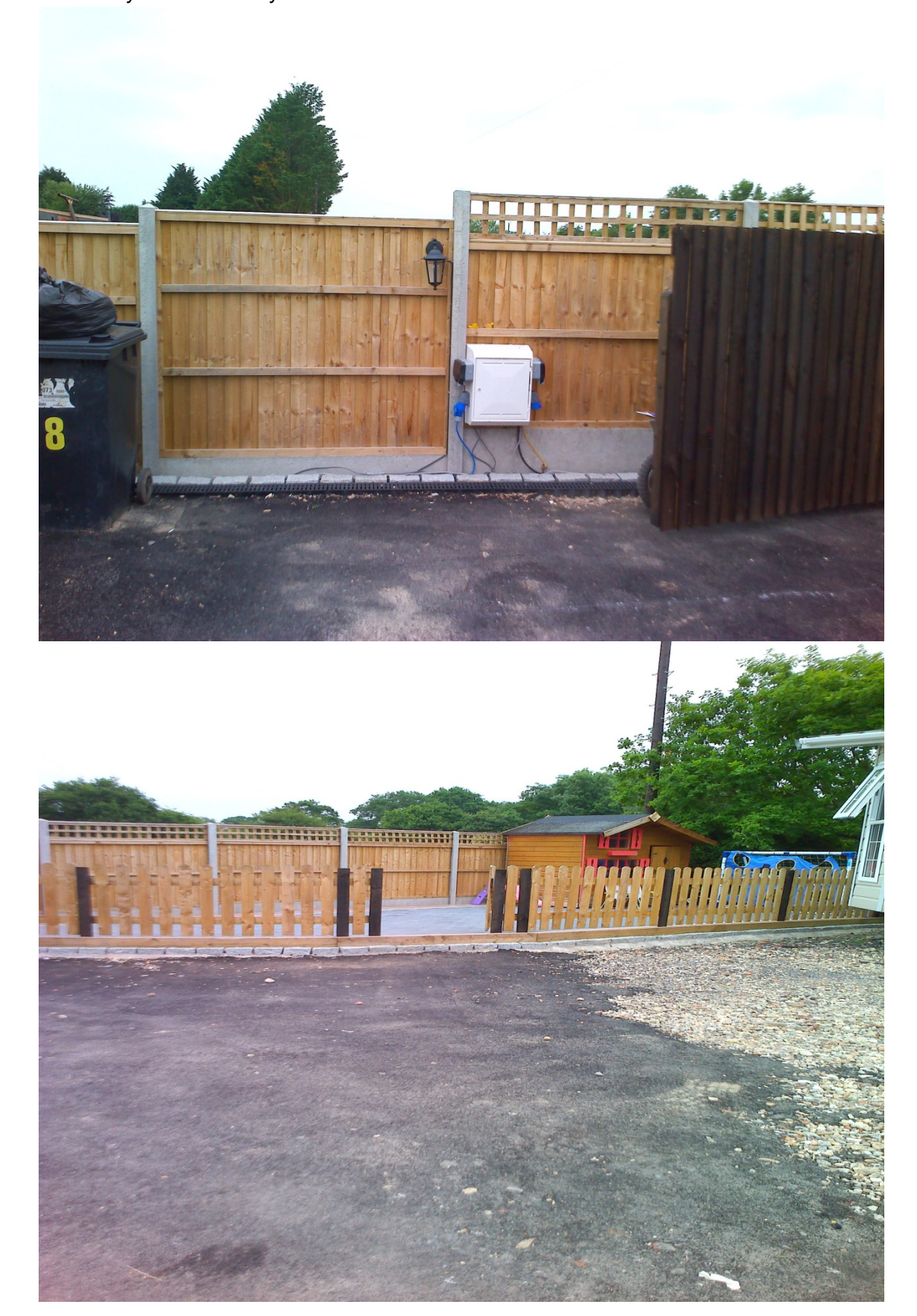
Play area for plot 8