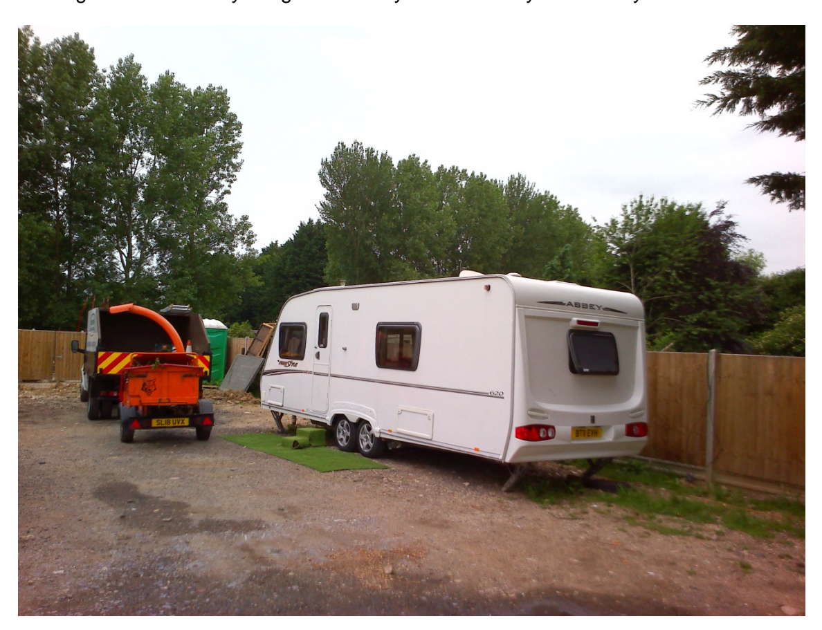
Static caravan to plot 3

Touring caravan used by daughters and by the Lee family when away from the site