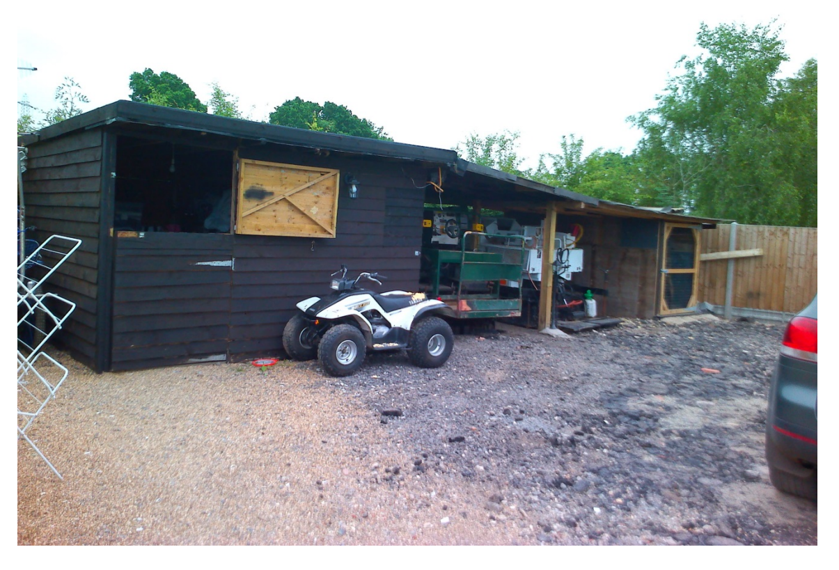
Stables, kennels and equipment shed to the rear of plot 8