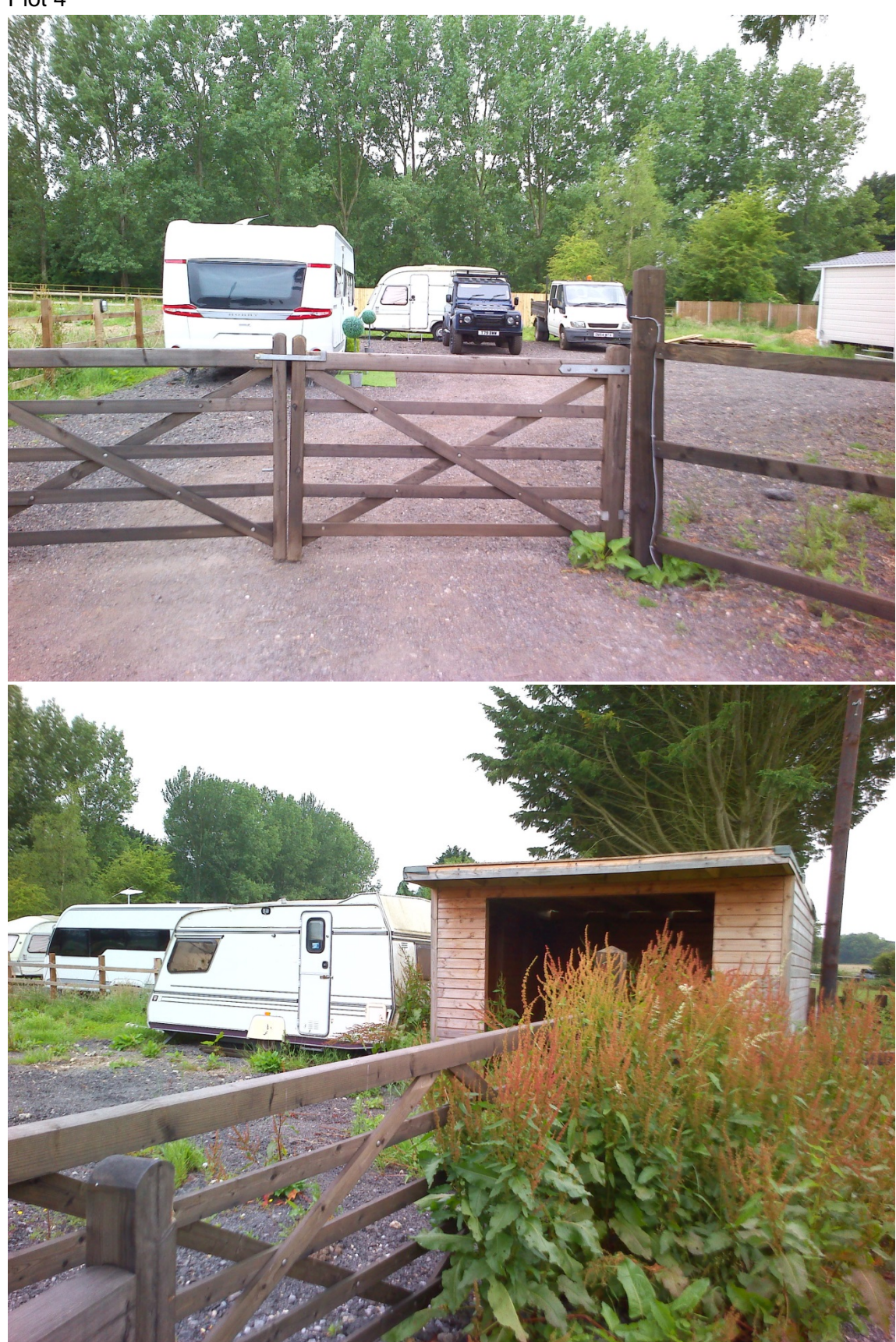
Plot 5 unoccupied caravan and shelter