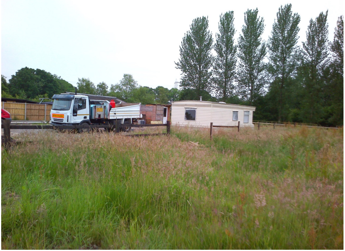
Plot 7 Used by Knight Family (plot 8) for work vehicles and touring caravan.