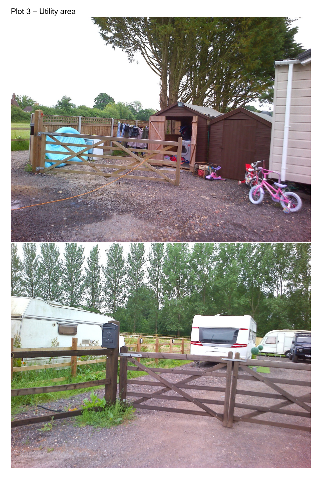
Plot 4 Occupied but no one on site at the time of the visit - 1 pitch