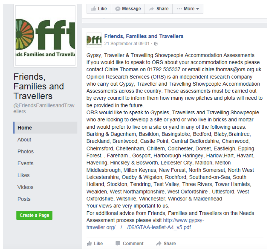
Figure 16 – Bricks and mortar advert