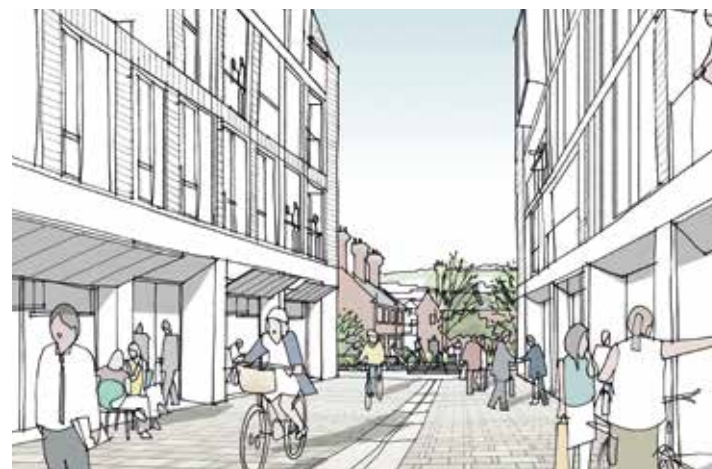
Friarsgate Passage (artist's impression)

The SPD is a formal planning document, so it covers all the details required to make informed decisions. It has been written in a user friendly style to make it as accessible as possible. If you require this document in an alternative format please let us know.