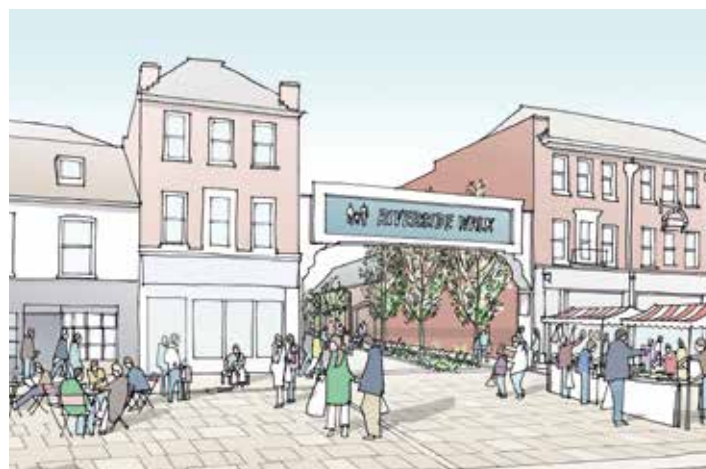
Riverside Walk from the Broadway (artist's impression)