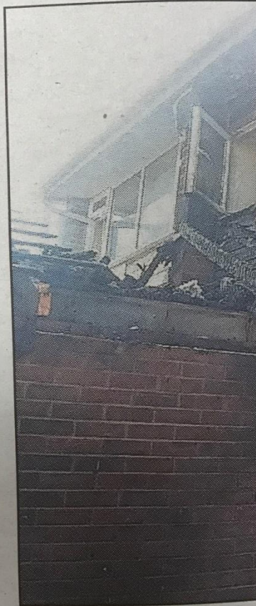
Damage at the rear of the