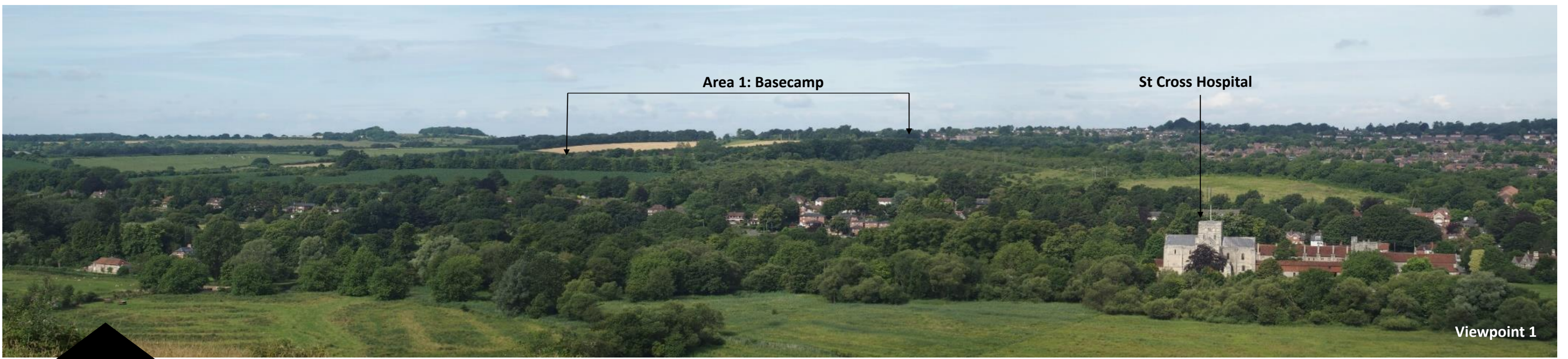
VIEW LOOKING IN FROM ST CATHERINE'S HILL View looking across the Itchen valley to Bushfield camp from just below the summit of St Catherine's Hill with the river Itchen in the valley below and St Cross Hospital to the right. The Basecamp site, Area 1, is largely concealed by belts of trees including the beech hanger and sits well below the skyline. The remaining areas of the site, Areas 2 and 3 are open and exposed.