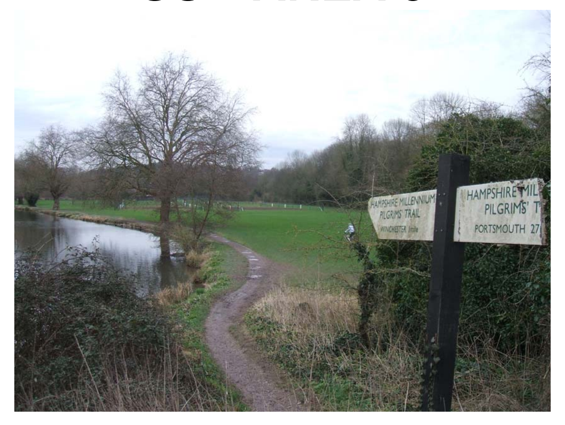
Soberton, Southwick and Widley, <u>Denmead</u>, Boarhunt, Hambledon