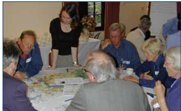
Stakeholder Workshop, Winchester, July 2002

The process began with an evening workshop held in Winchester with invited parish councils, councillors, amenity groups, residents groups, adjacent district councils, government agencies and Winchester City Council officers. This provided a central location for all interested parties to meet. By just holding one meeting, it also meant that there was a good concentration of attendees to debate the issues, with over 35 people attending in total. The workshop enabled Winchester City Council to provide a presentation of the work that had been carried out to date and explain why the assessment was being carried out.