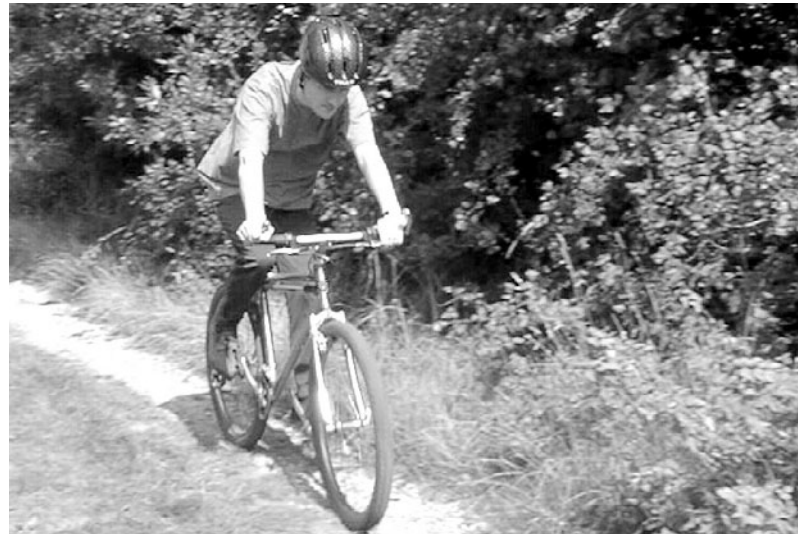
“Significant improvements to existing pedestrian and cycle networks will be required”

10.28 In the rural parts of the District, a cycling strategy has been developed as part of CHARTS in partnership with the County Council and local cycle groups. This aims to provide safe and practical connections