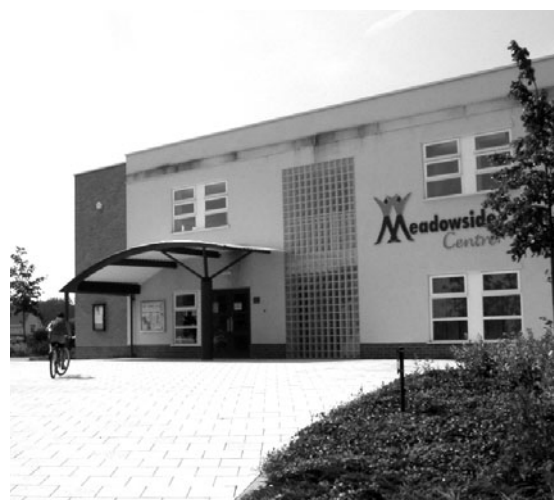
"Inadequacies in infrastructure can be overcome by new and improved facilities"

3.47 It is necessary to ensure that development does not overload physical or social infrastructure (e.g. local roads, schools, health and welfare provision or sewage works). In many cases inadequacies in infrastructure can be overcome by providing new or improved facilities. Where such provision results directly from proposed development, developers will be expected to ensure that development makes a fair contribution towards its cost.