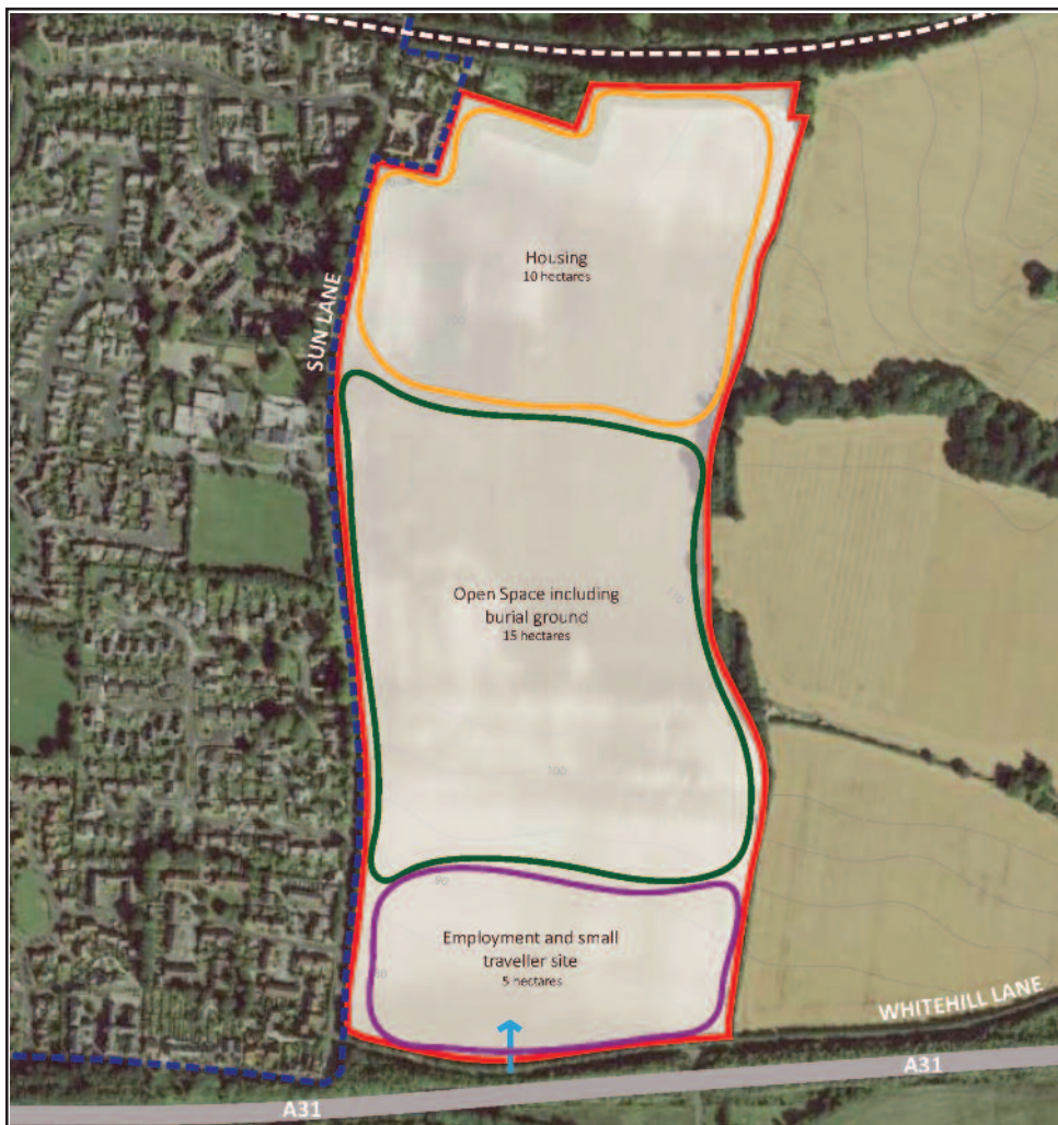
Map showing the potential broad layout of uses for Sun Lane.