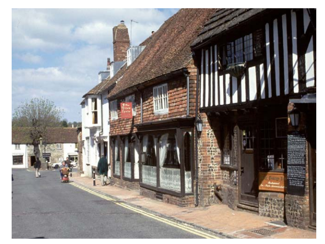
Alfriston, East Sussex