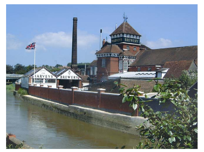
Harveys Brewery, Lewes, East Sussex