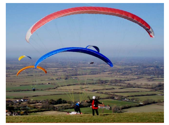
Paragliding near Lewes