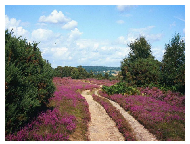
Heathland habitat, Iping Common, West Sussex