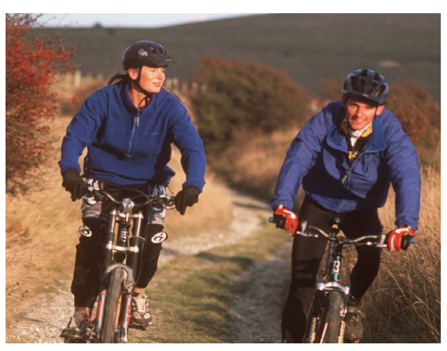
Cycling on the South Downs Way

The variety of landscapes, wildlife and culture provides rich opportunities for learning about the South Downs as a special place, for the many school and college students and lifelong learners. Museums, churches, historic houses, outdoor education centres and wildlife reserves are places that provide both enjoyment and learning. There is a strong volunteering tradition providing chances for outdoor conservation work, acquiring rural skills, leading guided walks and carrying out survey work relating to wildlife species and rights of way.