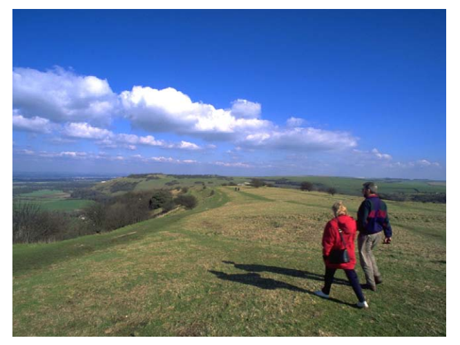
Walkers on the South Downs Way, Devil's Dyke