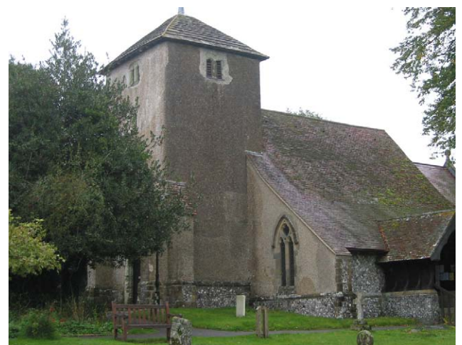
Saxon Church, Singleton, West Sussex