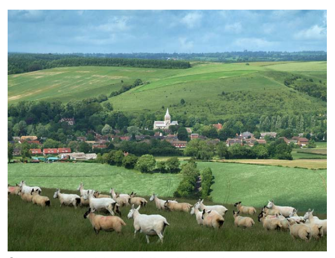
Sheep in the Meon Valley, Hampshire