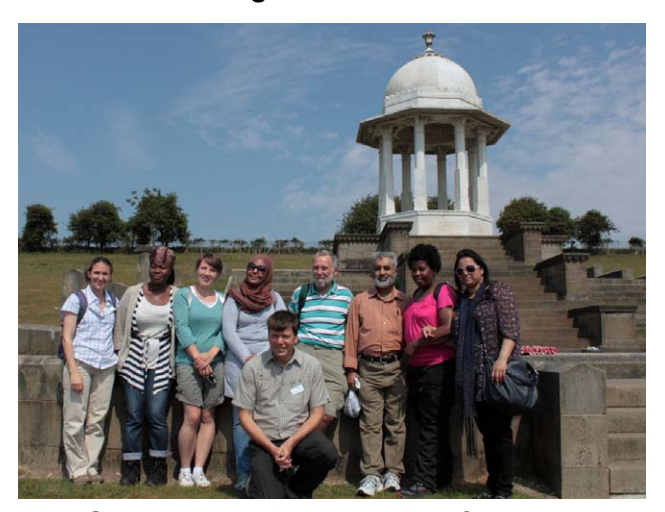
The Chattri, above Brighton, East Sussex