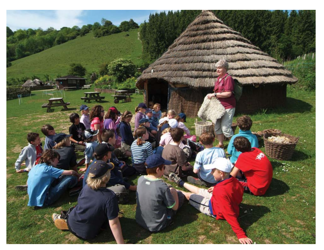
Butser Ancient Farm, Chalton, Hampshire