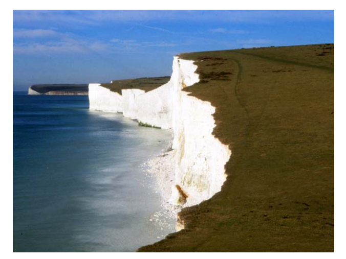
Seven Sisters, East Sussex