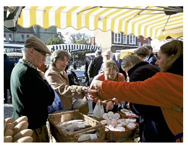
Farmers' Market, Petersfield, Hampshire