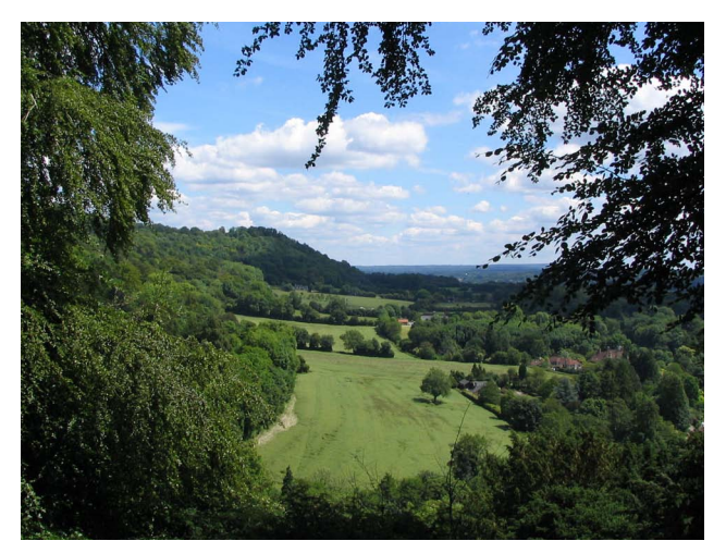
The Hangers from Stoner Hill, Hampshire