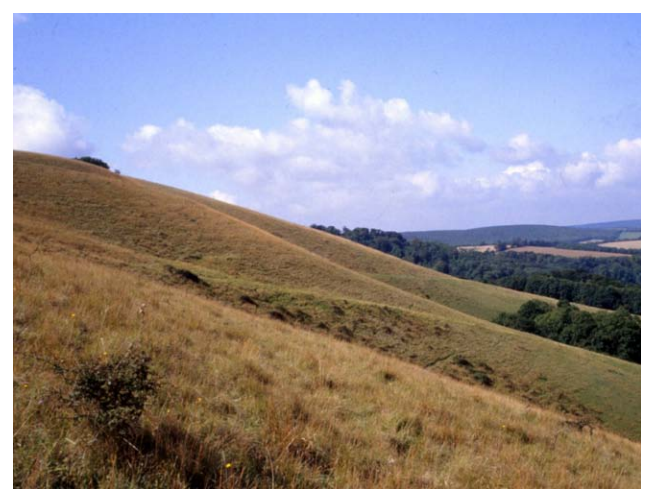
Harting Down, West Sussex

There are stunning, panoramic views to the sea and across the Weald as you travel the hundred mile length of the South Downs Way from Winchester to Eastbourne, culminating in the impressive chalk cliffs at Seven Sisters. From near and far, the South Downs is an area of inspirational beauty that can lift the soul.