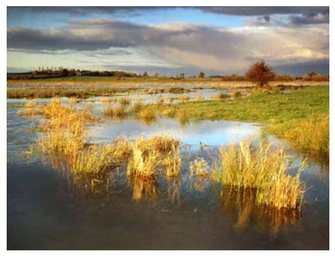
Amberley Wildbrooks, West Sussex

The South Downs National Park is in South East England, one of the most crowded parts of the United Kingdom. Although its most popular locations are heavily visited, many people greatly value the sense of tranquillity and unspoilt places which give them a feeling of peace and space. In some areas the landscape seems to possess a timeless quality, largely lacking intrusive development and retaining areas of dark night skies. This is a place where people seek to escape from the hustle and bustle in this busy part of England, to relax, unwind and re-charge their batteries.