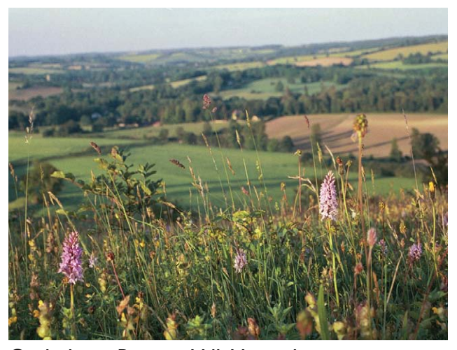
Orchids on Beacon Hill, Hampshire