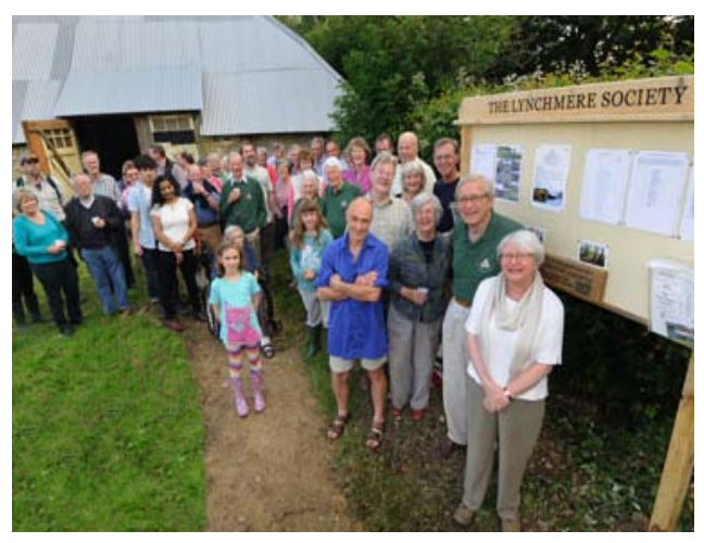
The Lynchmere Society, West Sussex

Many of these settlements contain strong and vibrant communities with much invested in the future of where they live, and a sense of identity with their local area, its culture and history. Across the South Downs there are also communities of people who come together through common interests, for example, farming, conservation and recreation. These communities dedicate time and resources to enhancing community life, conserving what is important to them and planning for future generations.