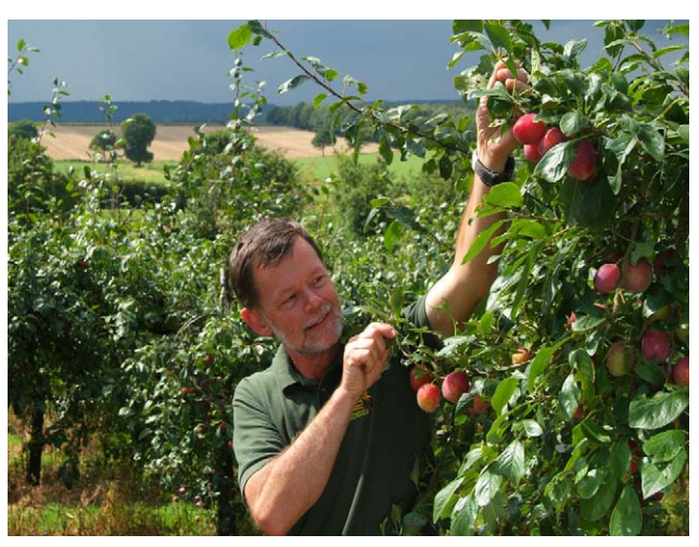
Durleighmarsh Farm & Orchard, West Sussex

However, the economy of the National Park is by no means restricted to farming. There are many popular tourist attractions and well-loved local pubs which give character to our towns and villages. The National Park is also home to a wide range of other businesses, for example new technology and science, which supports local employment.