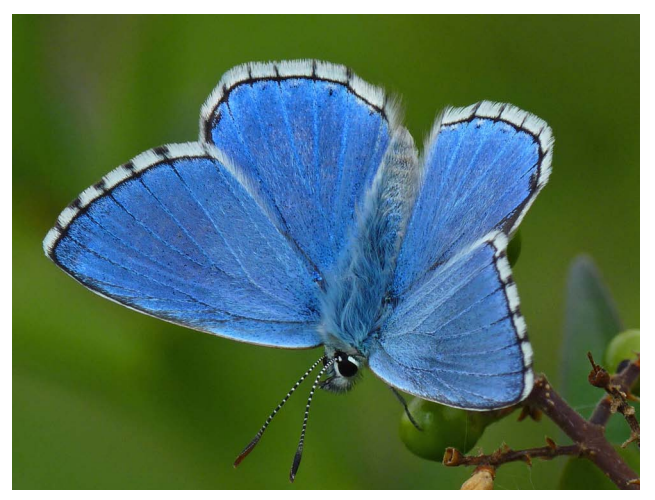
Adonis blue butterfly

The river valleys intersecting the South Downs support wetland habitats and a wealth of birdlife, notably at Pulborough Brooks. Many fish, amphibians and invertebrates thrive in the clear chalk streams of the Meon and Itchen in Hampshire where elusive wild mammals such as otter and water vole may also be spotted. The extensive chalk sea cliffs and shoreline in the East host a wide range of coastal wildlife including breeding colonies of seabirds such as kittiwakes and fulmars.