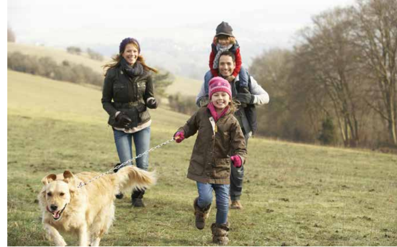
Open spaces can be occupied in a range of ways. We believe the park can be better used by a wider range of people. More people, more variety, more inhabitation.