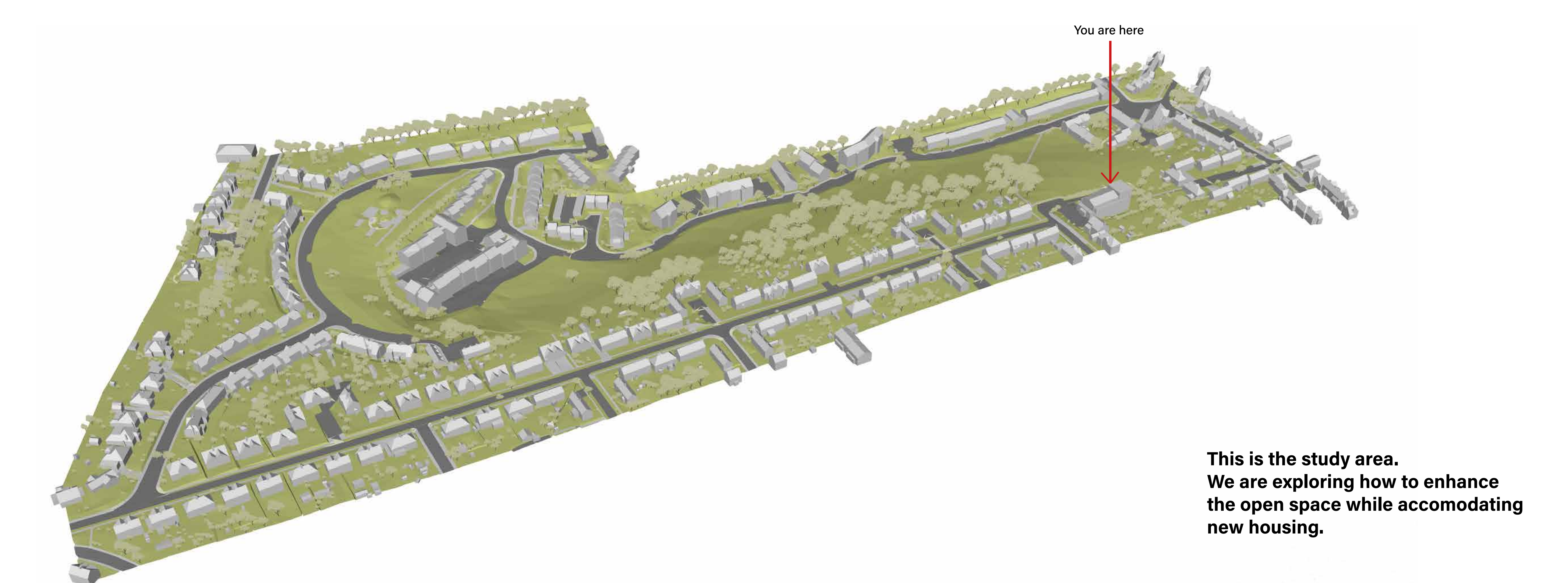
3d axonometric of site