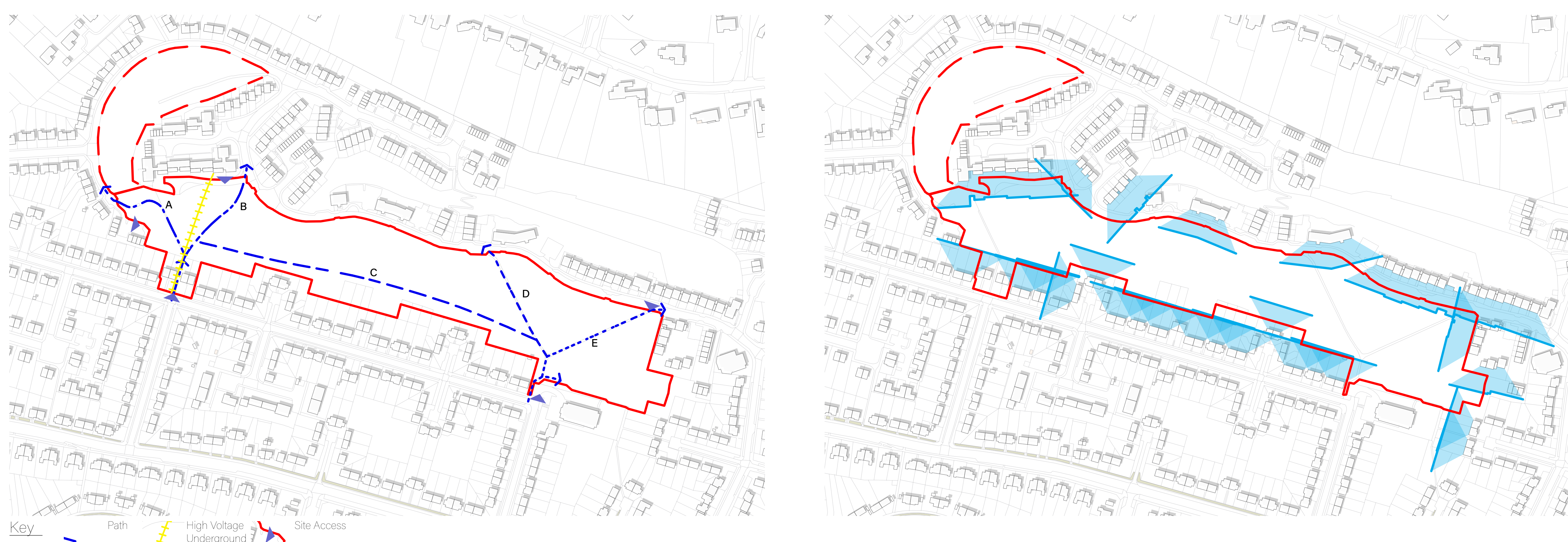
Overlooking/Impact on Neighbours

We have sought to identify the key issues on the site. These create both constraints and opportunities.