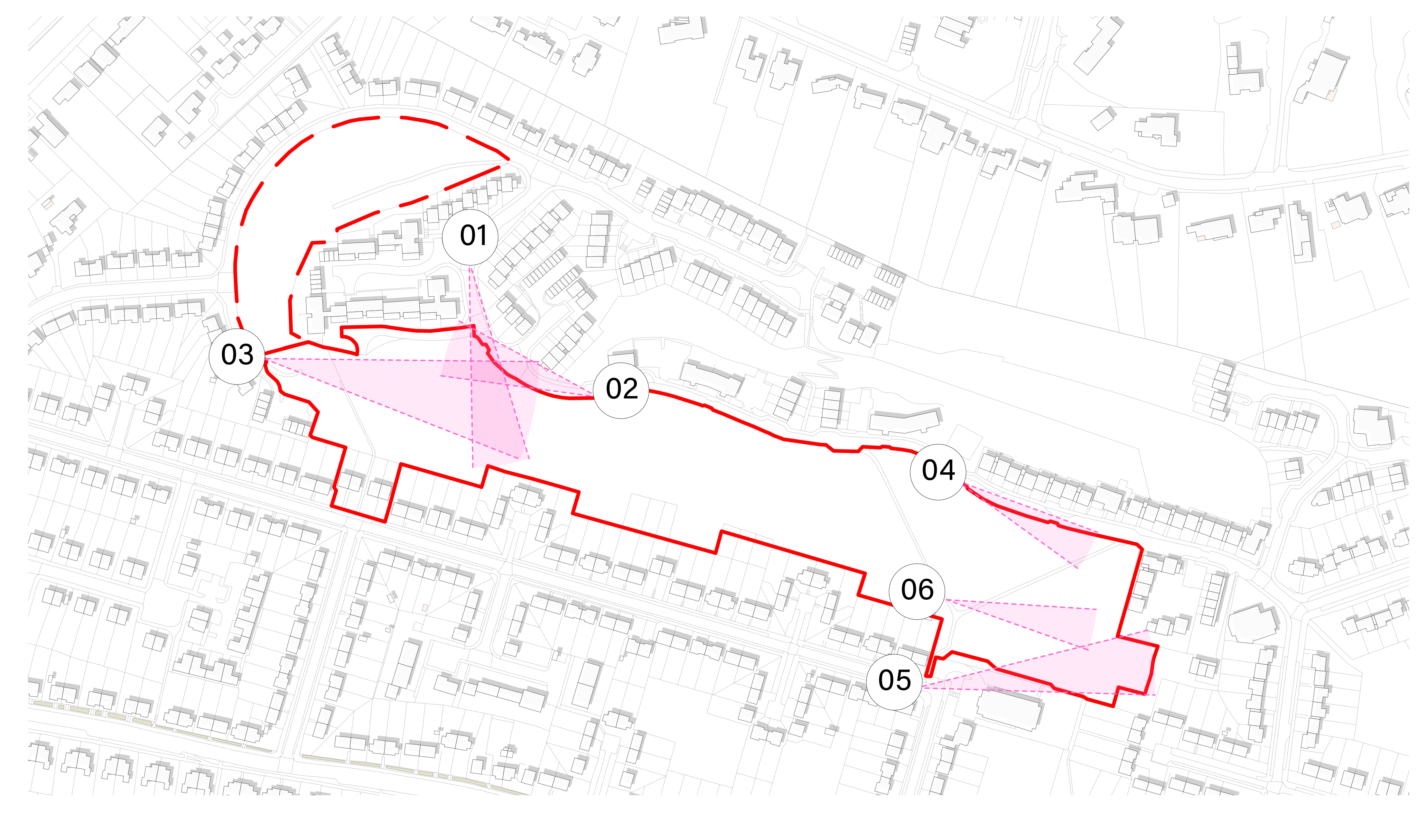
We have identified a number of key views through and around the site. We want to protect and enhance these views.