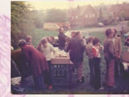
sponsored walk picnic at somers' Close