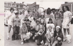
CHILDRENS SUBILEE PARTY