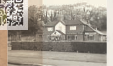
Queen's Head opens