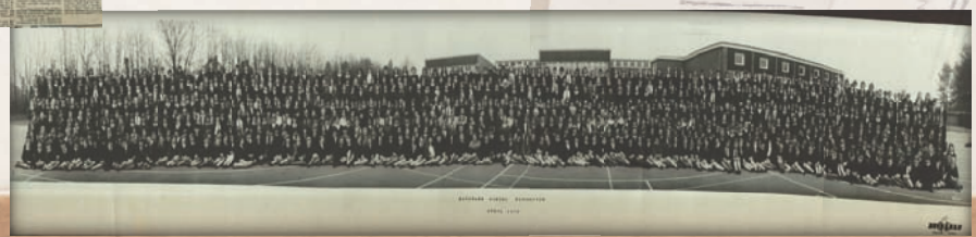
Danemark School, now King's School