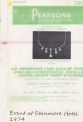
Event at Stanmore Hotel 1974