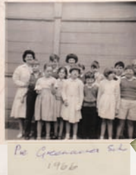
Pe Granville Sch 1966