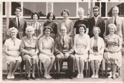
Remember all your dear teachers?