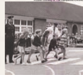
Road Safety lesson