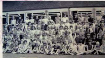
Stanmore school photo 1960