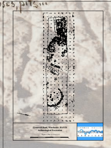
Cromwell Road, Winchester, HANTS archeological finds; by TVAS