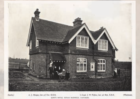
first buildings on Stanmore Estate