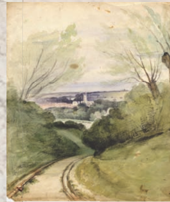
Winchester College from Stanmore Lane

"I believe they found traces of several round houses when they build Battery Hill. They even found a body. I think the remains are in the British Museum now."