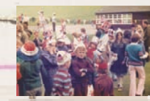
CHILDRENS JUBILEE PARTY