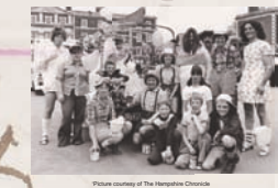
CHILDRENS JUBILEE PARTY