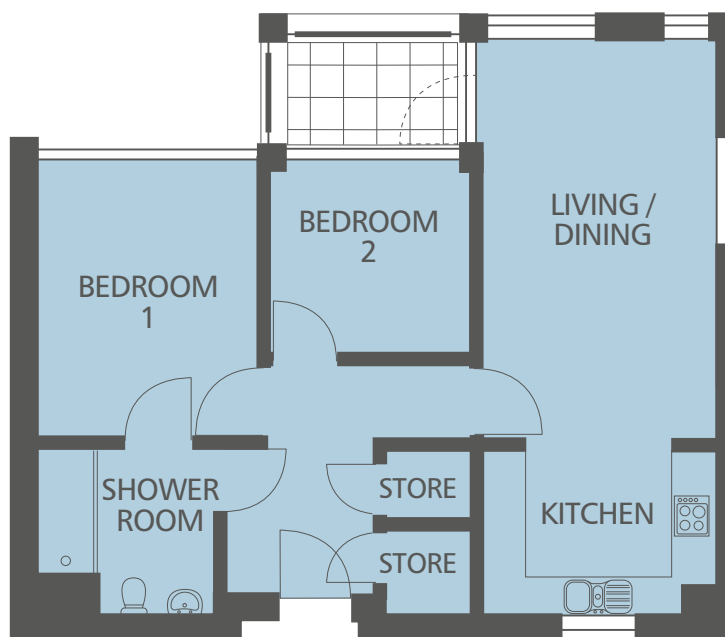
TWO BEDROOM APARTMENTS