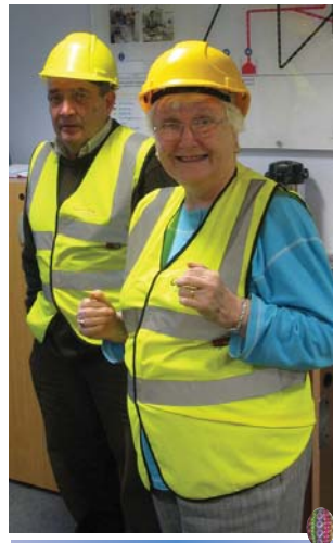
The team on location at the recycling plant.