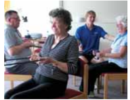
Armchair aerobics: Residents keeping fit at Makins Court

Winchester City Council and GetFit121 have joined forces to promote healthy living to residents living in sheltered accommodation across the area.