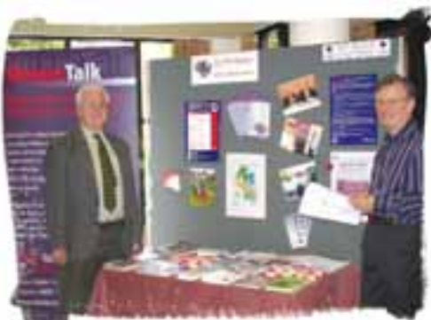
Tenants get talking at Winchester's summer conference.

Winchester's first Tenant Talk conference held in June this year has been hailed a great success with more events planned for the future.