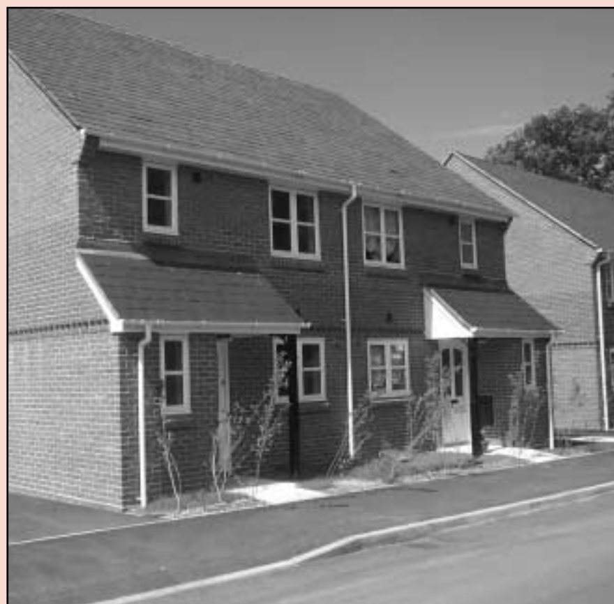
New homes at Knowle, developed by Swaythling Housing Society