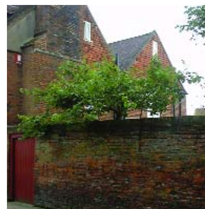
Characteristics of Winchester— Middle: Materials such as flint Bottom: Walled gardens and courtyards